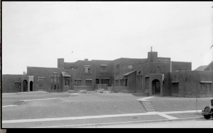
Hungarian Freedom Park