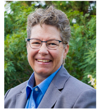
Principal-In-Charge Team Oversight/QC Mechanical/Plumbing/Cx