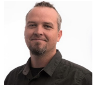
Principal Cost Estimating