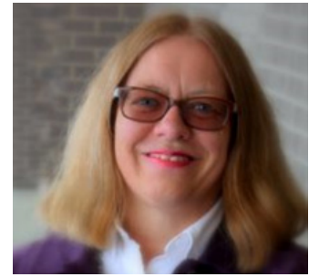
Principal - Senior Fire Protection Engineer