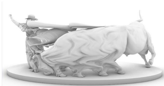
CONCEPTUAL IMAGES ONLY

To be completed by Mayor's Legislative Team: