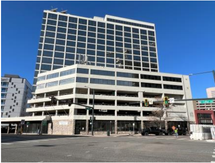
Minoru Yasui Building