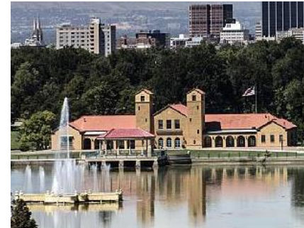
City Park Pavilion