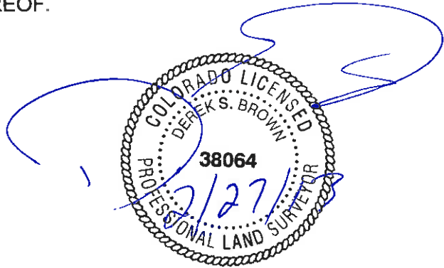
EXHIBIT ATTACHED AND MADE A PART HEREOF.