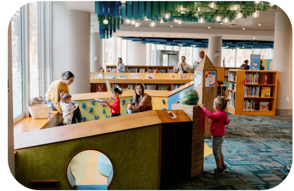
Central Library Children's Library