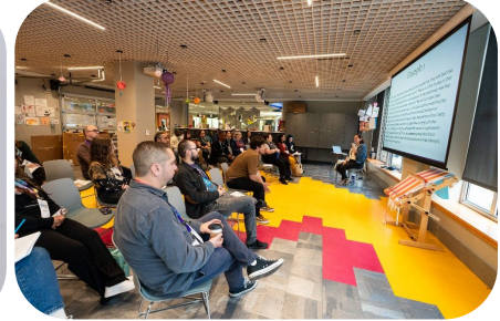
Staff Day 2025 Presentation in the Teen Library