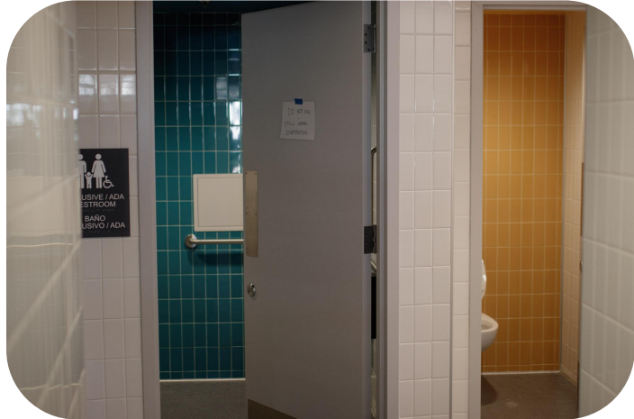
Sneak Peek of Restrooms at Ross-Phyllis Bigpond

7,000+ Newspapers & Magazines 120 Countries | 70+ Languages