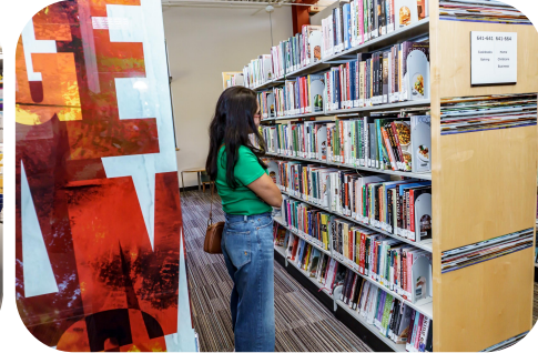
Browsable collection at Sam Gary Branch Library