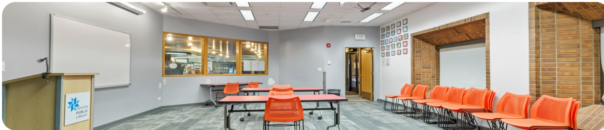
Eugene Field Branch Library Community Room

DPL Fund: Allocating significant resources from our special revenue fund to close gaps in bond funding.