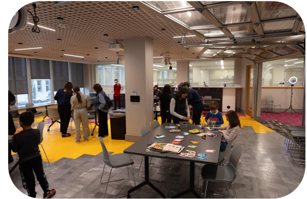
Central Library Teen Space