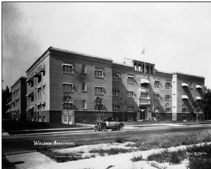
Denver Public Library, Western History and Genealogy