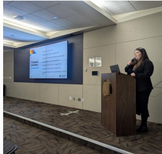
Professional Services Category On-Call Contracts Industry Event – April 8 th , 2025