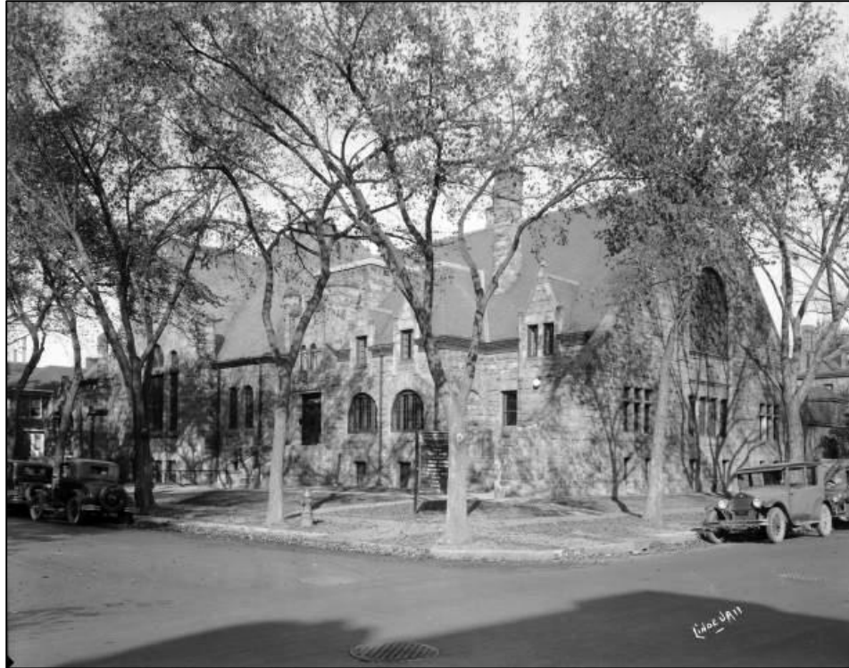
1400 Lafayette Street – First Unitarian Society of Denver, southwest elevation