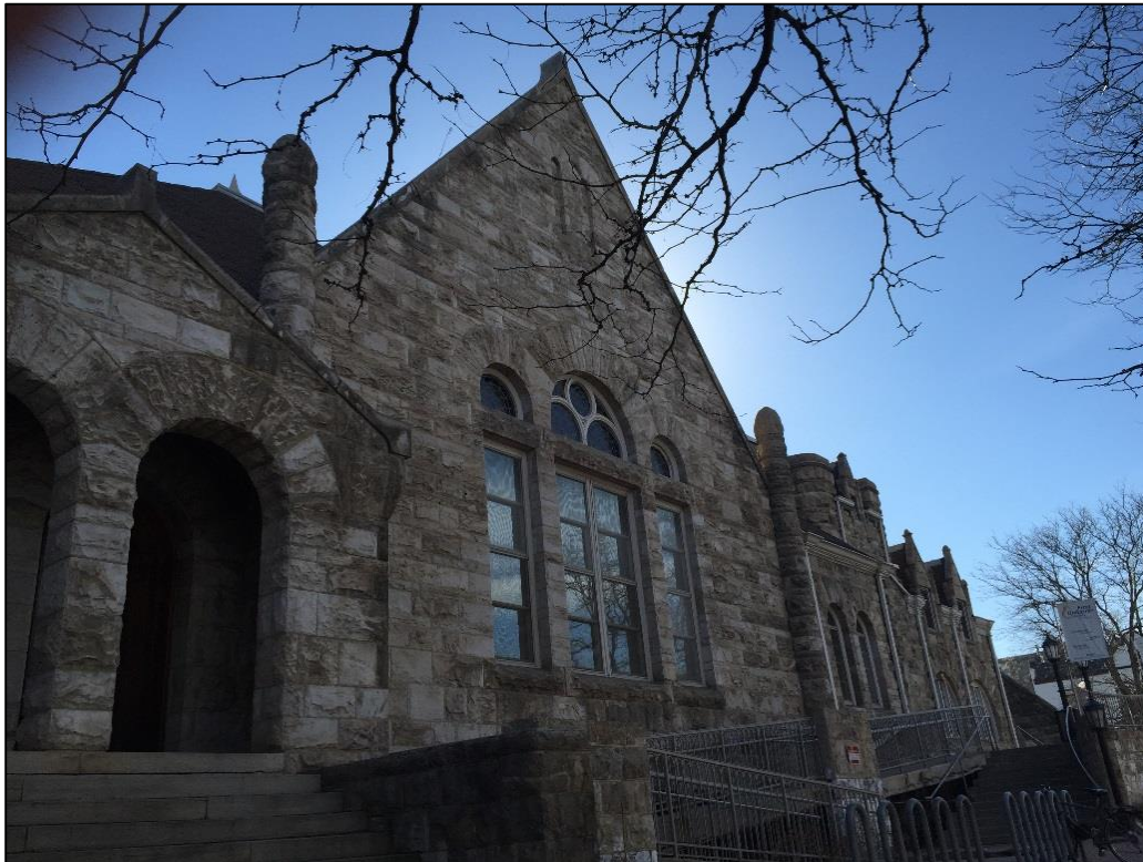
1400 Lafayette Street – First Unitarian Society of Denver, west elevation