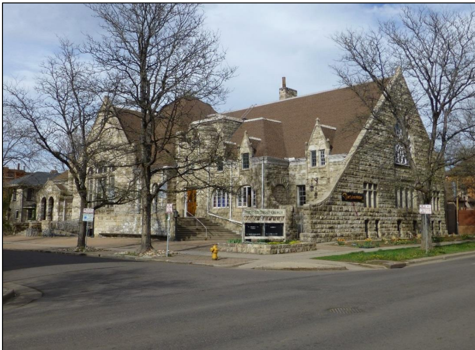
1400 Lafayette Street – First Unitarian Society of Denver, southwest elevation