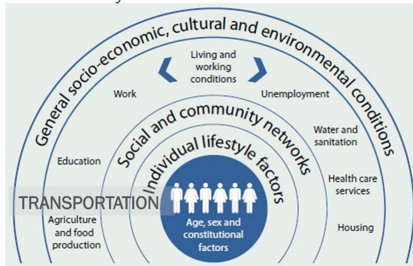
Social & Physical Determinants of Health