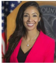
Councilmember Candi CdeBaca District 9