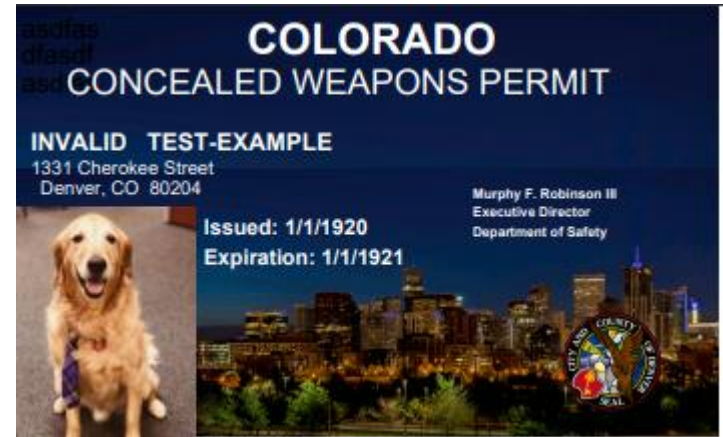
Example Permit – Back

D.O.B: 1/1/1900 HEIGHT: 200 WEIGHT: 0 HAIR: BLOND OR STRAWBERRY EYES: BROWN