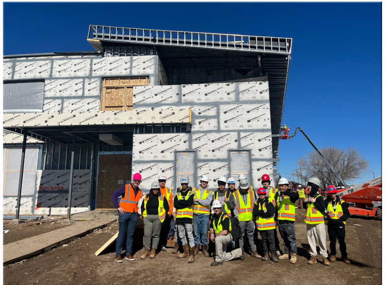
Our site team at the Jefferson High School Relocation & CTE project in Greeley give monthly tours and hands-on education to the Jefferson High School students that will attend the school in the fall.

Given the time period in which to respond to the Solicitation for On-Call Construction Services, Roche has not completed its Workforce Development plan. Currently, our senior staff and Human Resources Manager are developing the plan to include workforce coordination, outreach and engagement, training, and reporting and tracking and are looking forward to collaborating with WORKNOW and the City and County of Denver to ensure our plan is comprehensive and compliant.