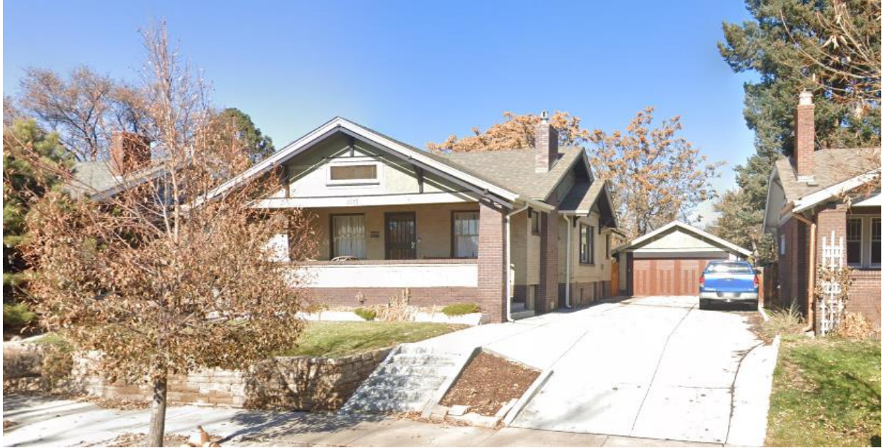
View of subject property looking north.