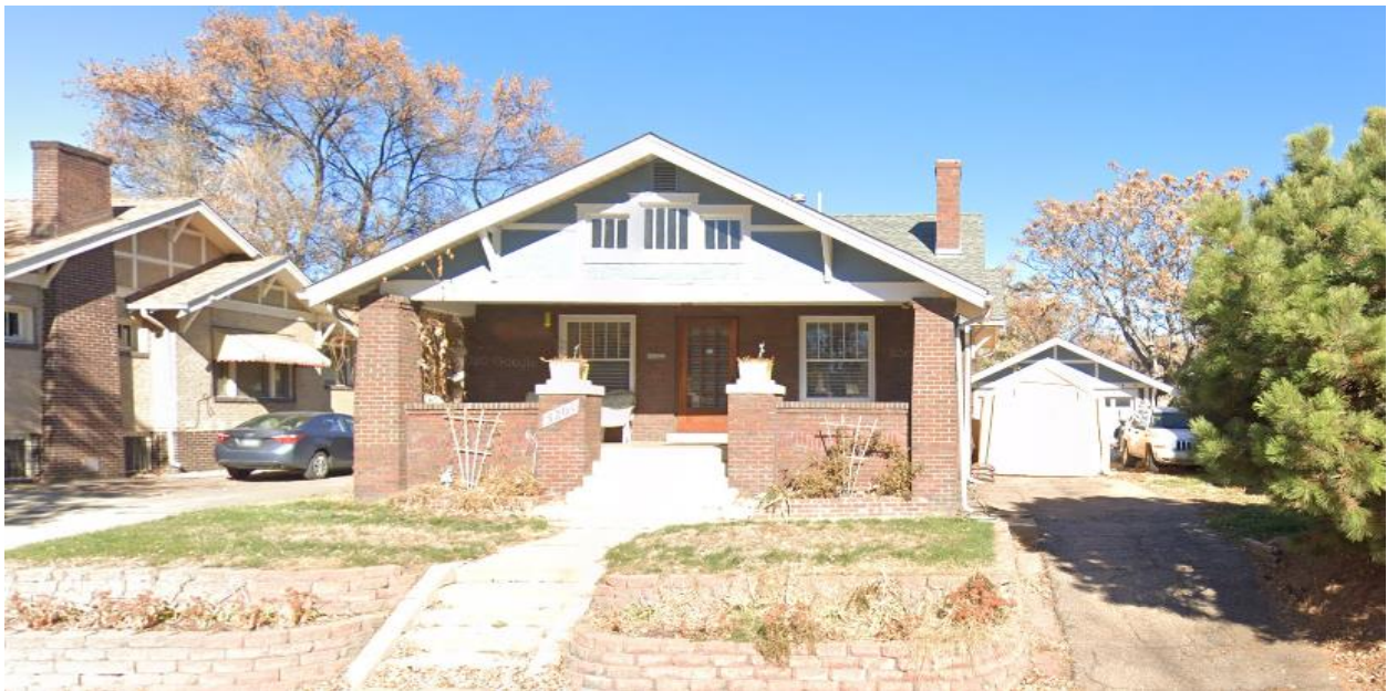
View of the property to the west, looking north.