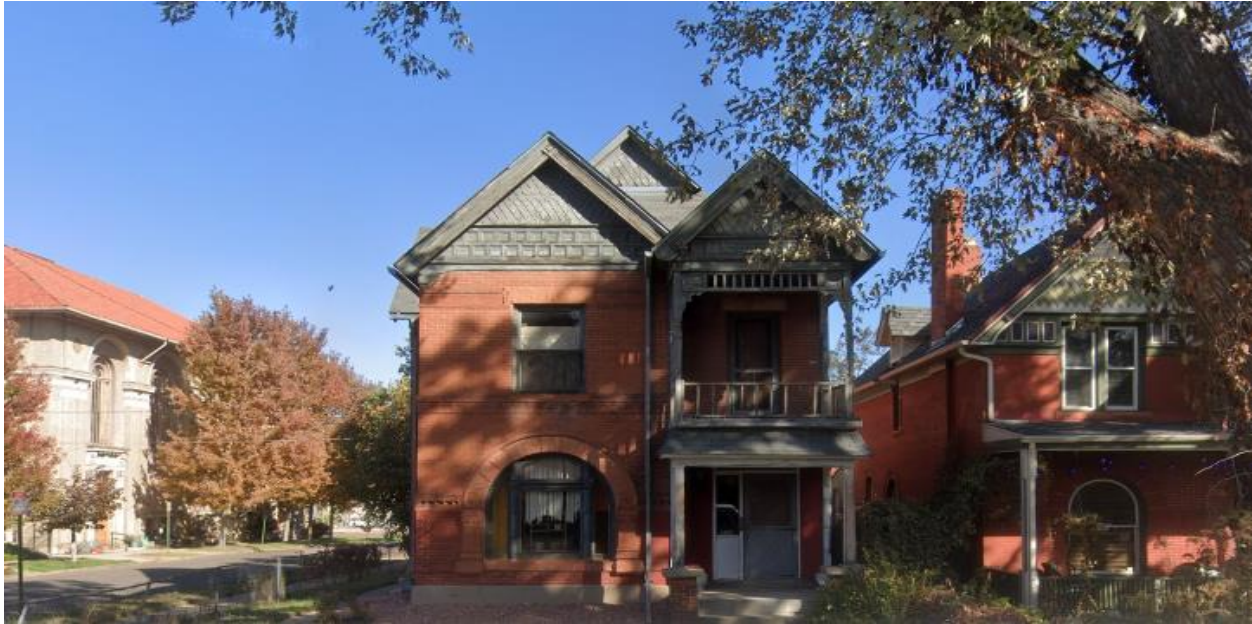
View of the property to the south, looking east.