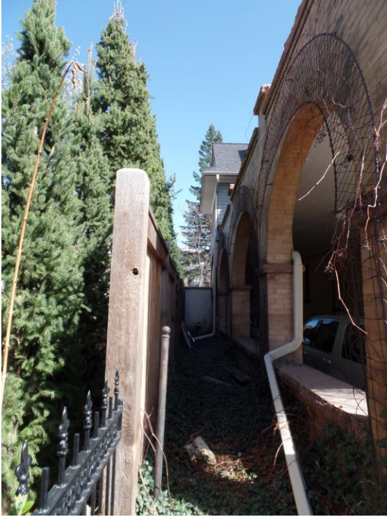
North side of house and porte cochere