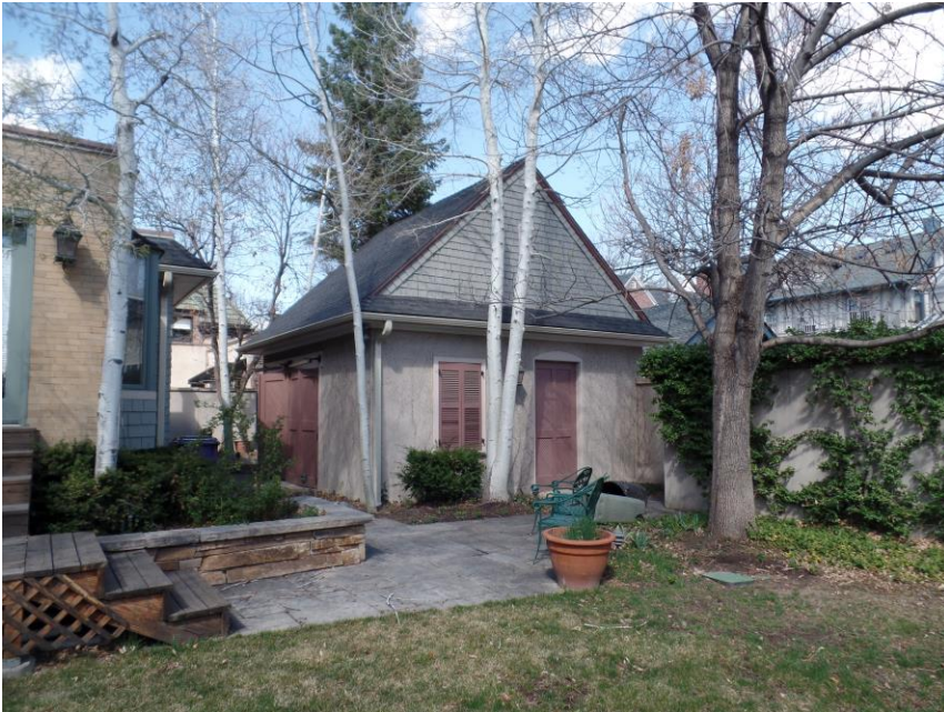
Carriage house from the south