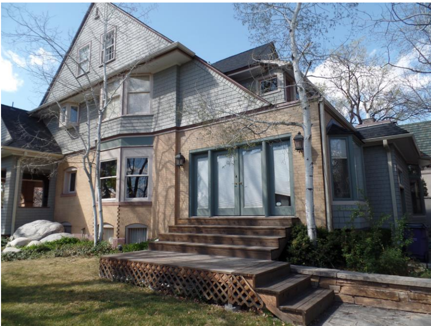
South side of house