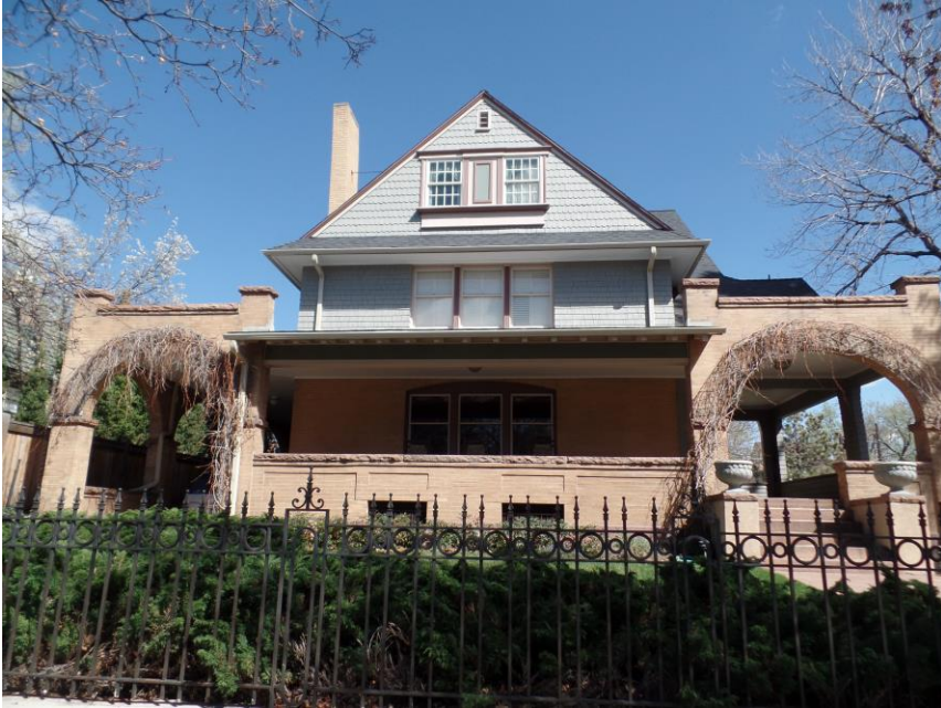
West side of house facing Marion Street