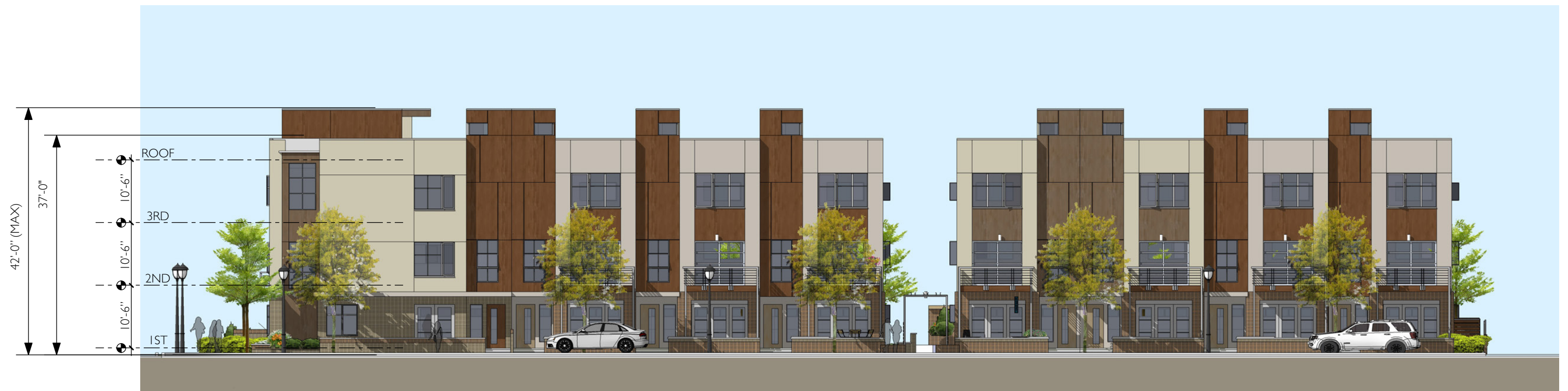
HARRISON STREET ELEVATION