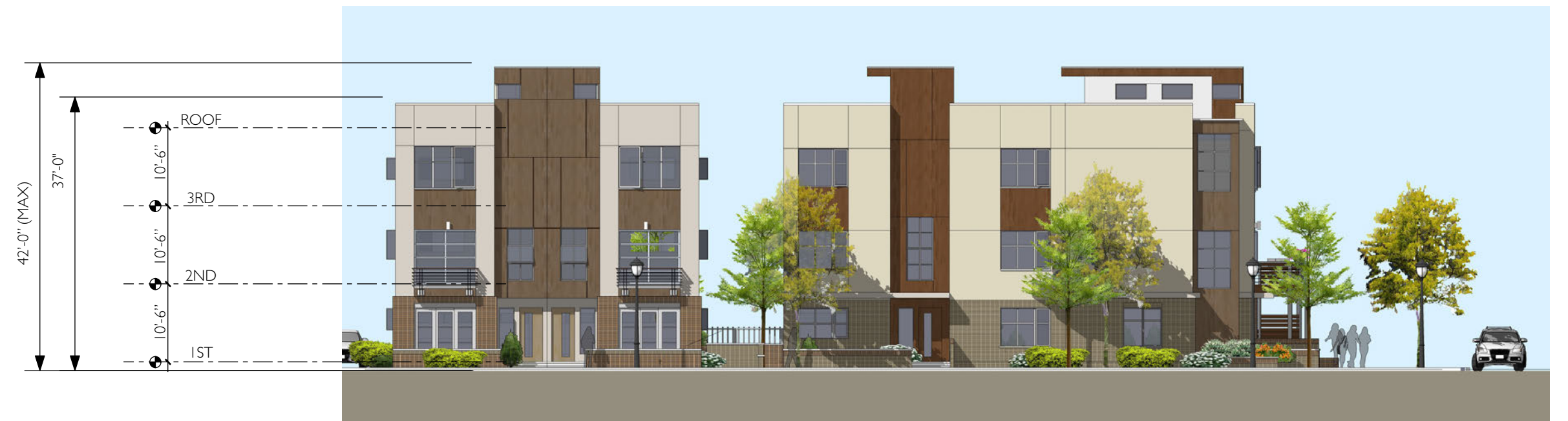
CEDAR STREET ELEVATION