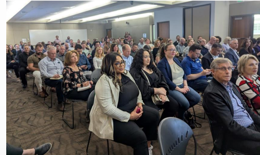
Professional Services Category On-Call Contracts Industry Event – April 8 th , 2025