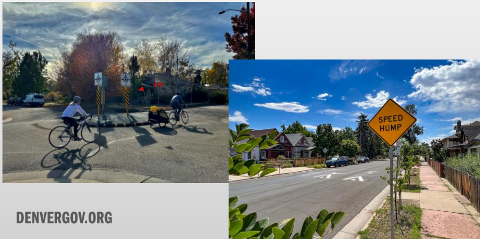
Community Transportation Network (CTN) Bike Facilities