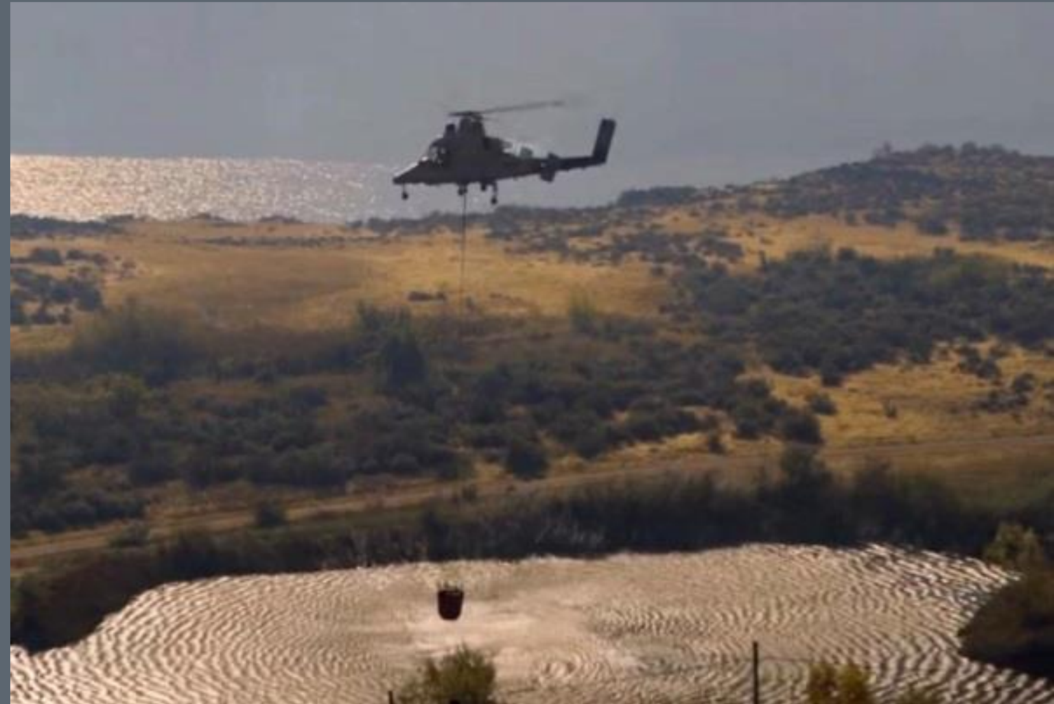
Lockheed Martin K-MAX with 6,000lb Payload