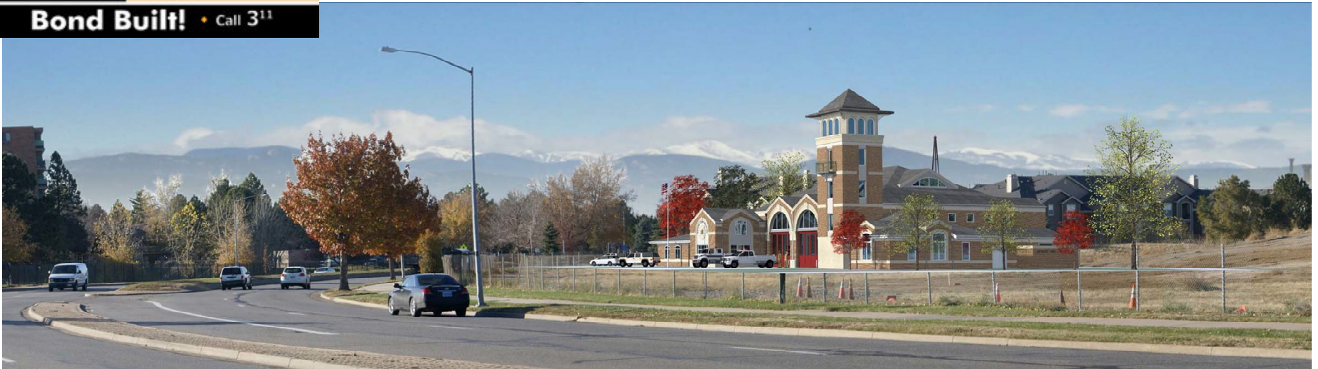
ALAMEDA AVENUE LOOKING NORTHEAST