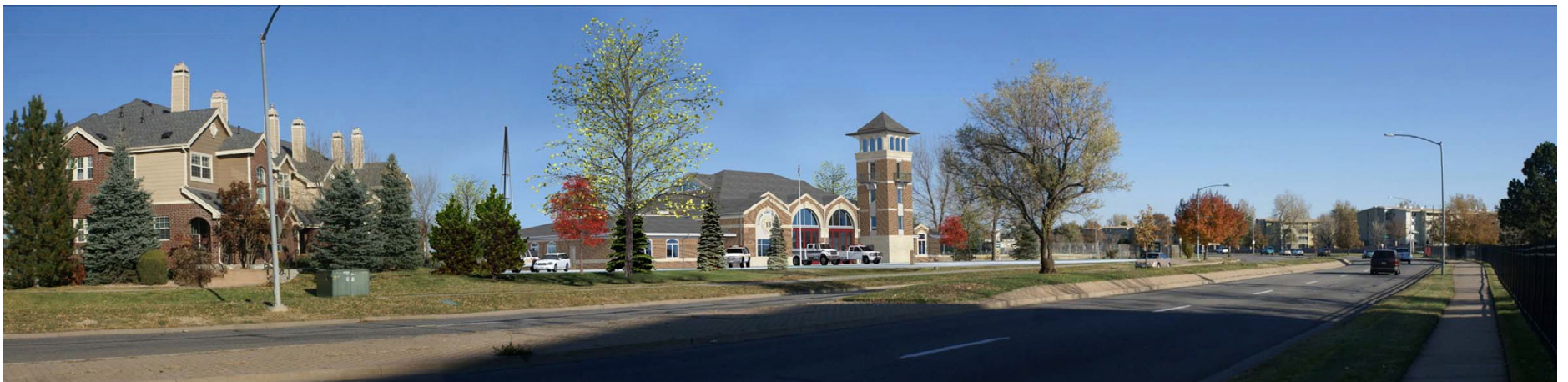
ALAMEDA AVENUE LOOKING EAST