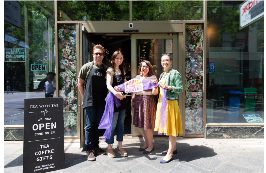
Tea with Tae Grand Opening