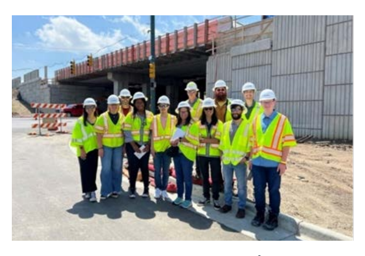
FIGURE 3: SUMMER 2023 ATKINSRÉALIS DENVER INTERN COHORT WITH I-70 AND HARLAN PROJECT STAFF

Additionally, AtkinsRéalis sees the need for more diversity internally in our Denver office and recognizes our responsibility as an industry leader to support a more diverse workforce. To that end, we have initiated an internship program with local high schools designed to introduce our industry to youth who identify with historically marginalized groups. With this internship program, we have the express intent of helping these students cultivate skills and professional experiences that will help them compete in the job market after they have completed their education. Our hope is to build strong, trusting relationships with these students so they return to our internship program throughout their education and view AtkinsRéalis as a potential future employer.