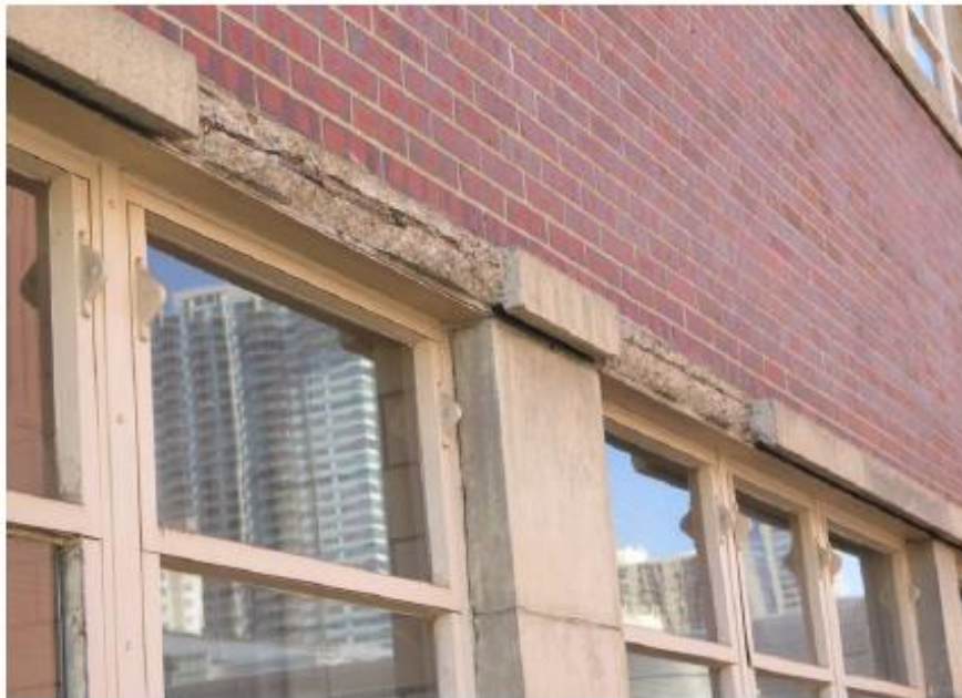
Deteriorated exterior elements above windows at Emily Griffith property