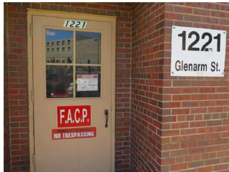
All entrances to any school buildings in the Study Area are marked with notices of closure and signs forbidding trespassing