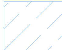
FOOD BANK - 2ND FLOOR Scale: 1/16" - 1'-0"