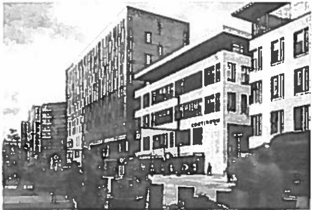
BLOCK A MIXED-USE PROJECT