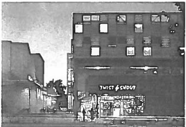
LOWENSTEIN RETAIL CENTER & PARKING GARAGE