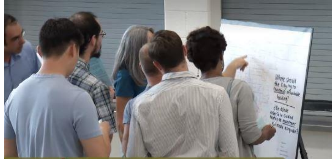
Comp Plan Public Meeting, 6/29/17

Two neighborhood meetings were also held during the plan development in North Denver