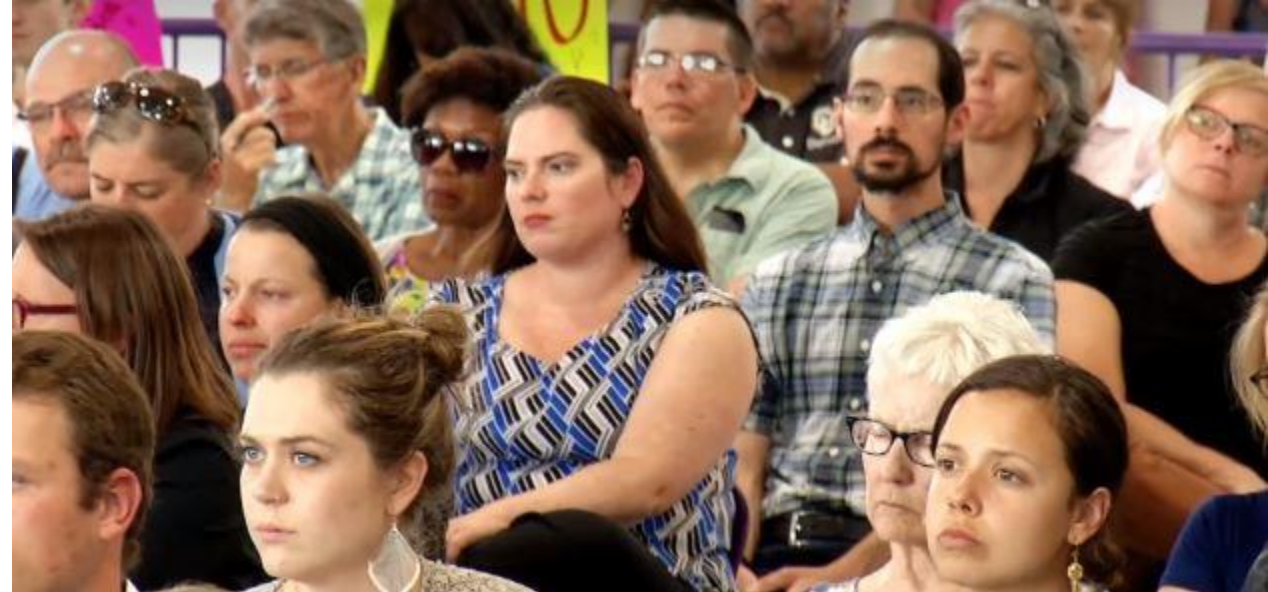
Comp Plan Public Meeting, 6/29/17