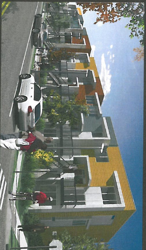
Aria Denver Apartments