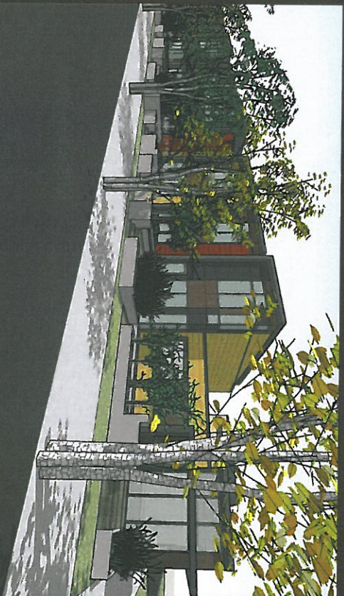
Aria Denver Townhomes