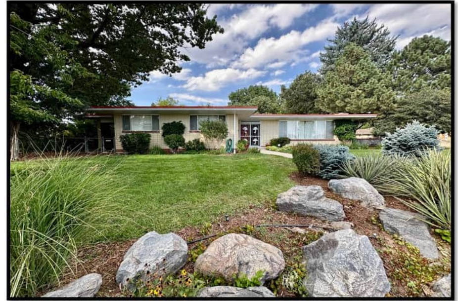
3535 E 26th Ave. Pkwy. Denver, CO 80205