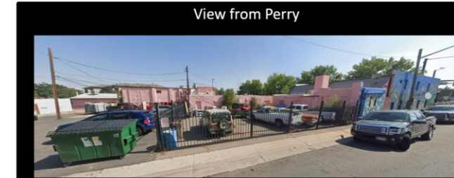
View from Perry