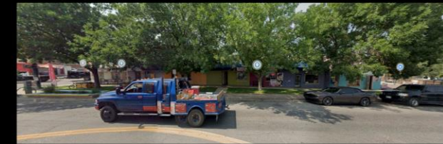
View from Morrison