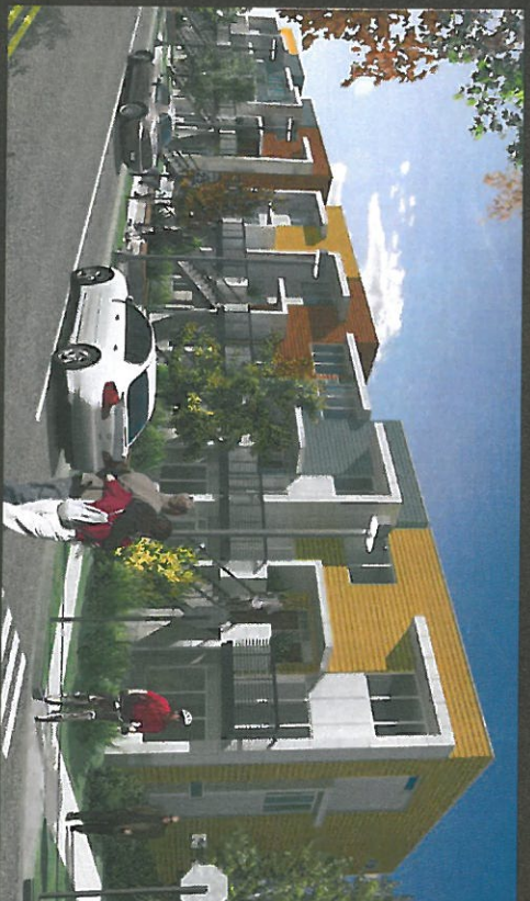
Aria Denver Apartments