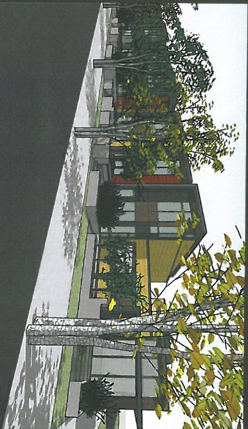
Aria Denver Townhomes