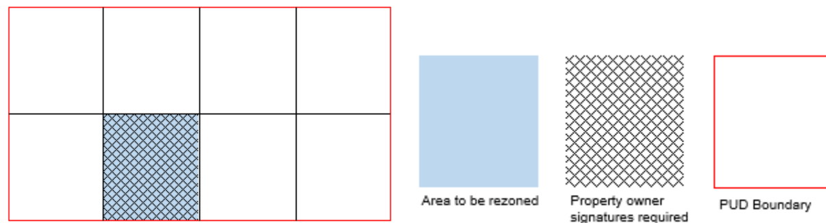
Figure I.2 Illustration of Proposed Requirement