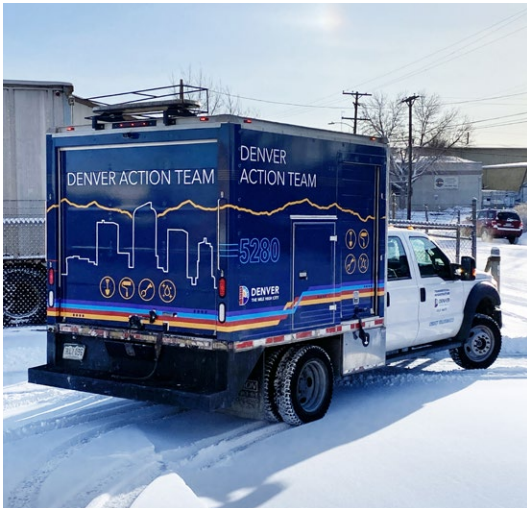
CCD On-Call: 16th St Mall Restroom (left), with graphics adapted by studiotrope to fit the Denver Action Team fleet trucks (right)