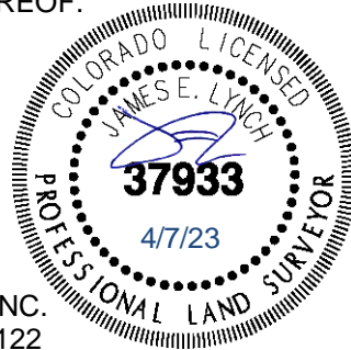
ILLUSTRATION ATTACHED AND MADE A PART HEREOF.