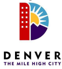
EXHIBIT A-2 SCOPE OF WORK & BUDGET