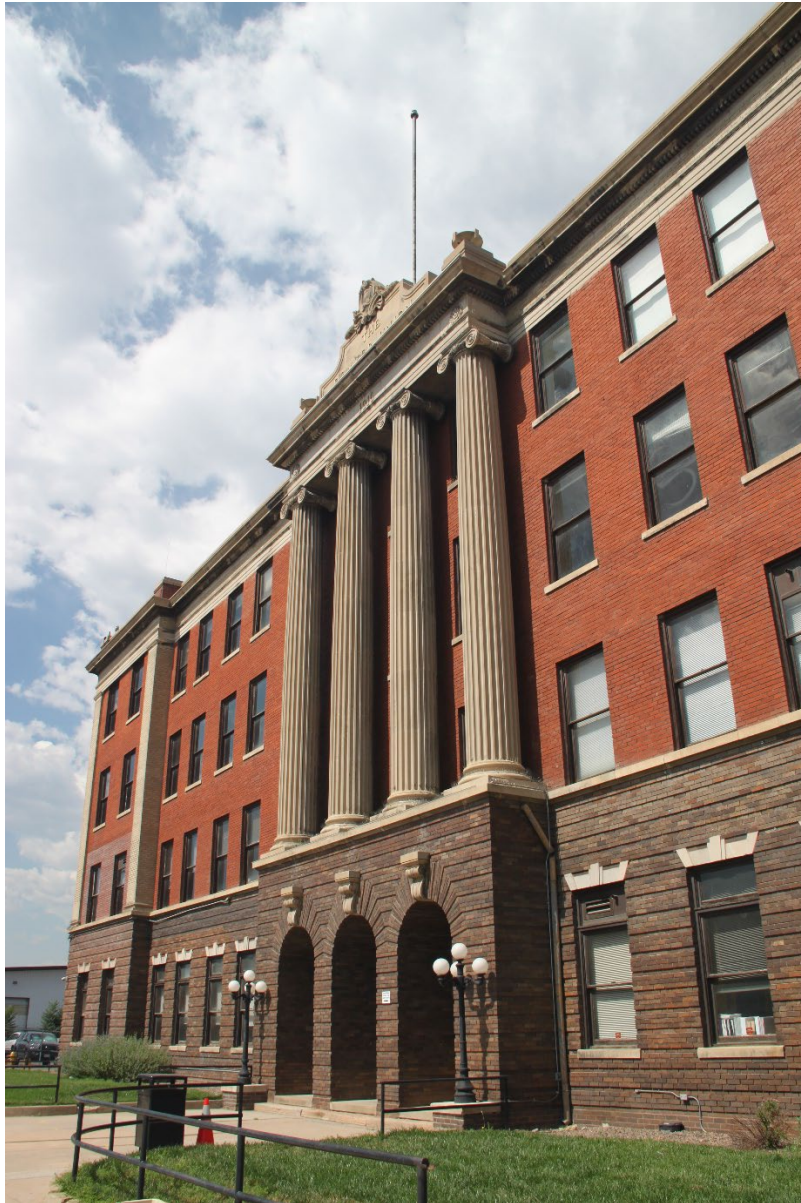
Figure B-7. Detail of Classical Revival 1916 main entry portico, columns, and other decorative features. View facing southwest. 86