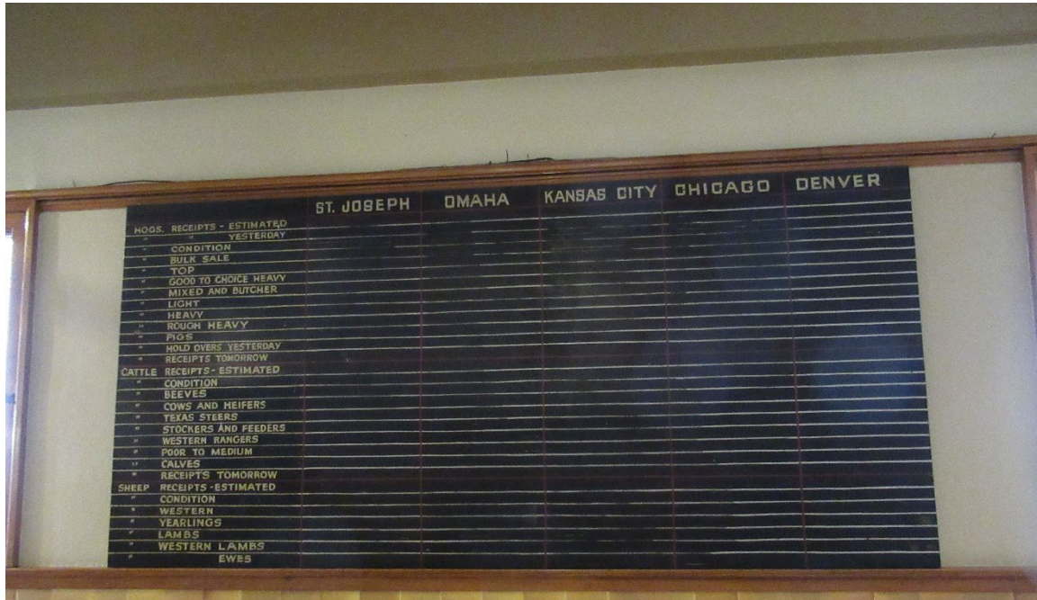
Figure B-17. Historic chalkboard in second story hall, 1916 structure. 100