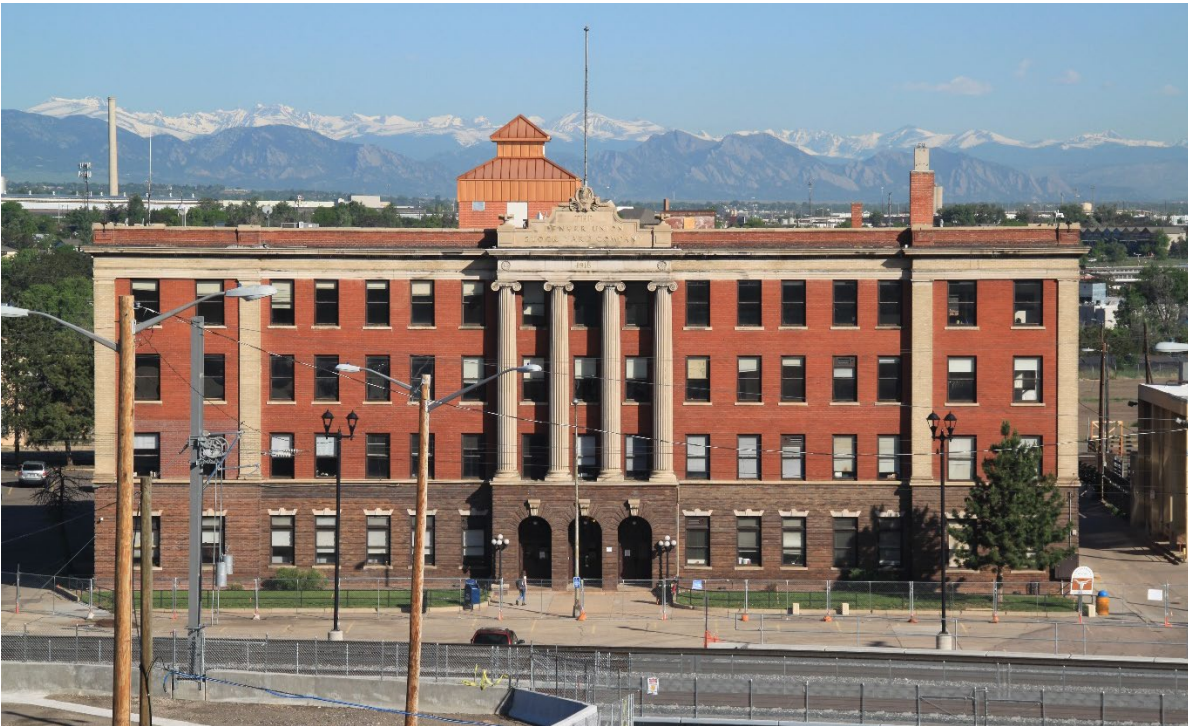
Figure B-6. Front (southeast) facade of the Livestock Exchange, 1916 structure. View facing northwest. 85