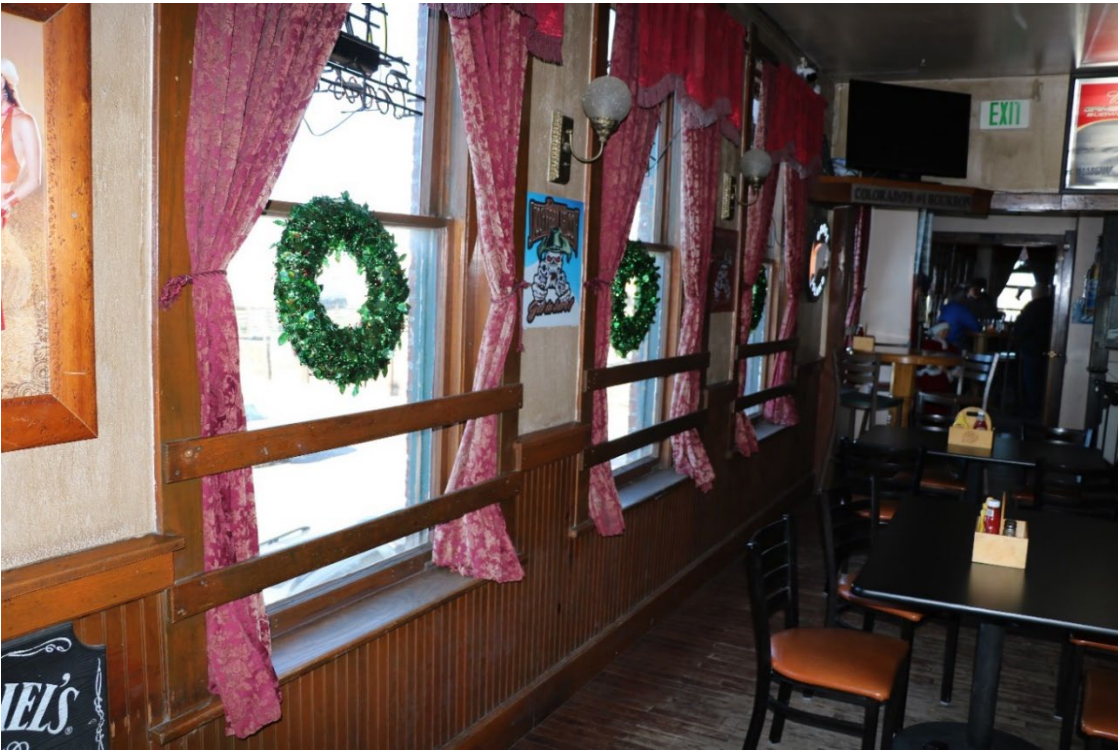
Figure B-21. Interior of 1919 structure showing wood floors, wainscoting, and window trim. 104