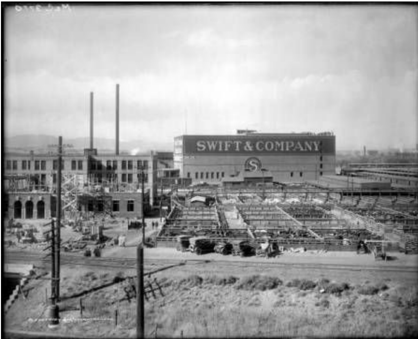
Figure B-2. Photo of the Livestock Exchange during construction of the 1916 structure. Swift and Co. packing plant seen in the background. 81