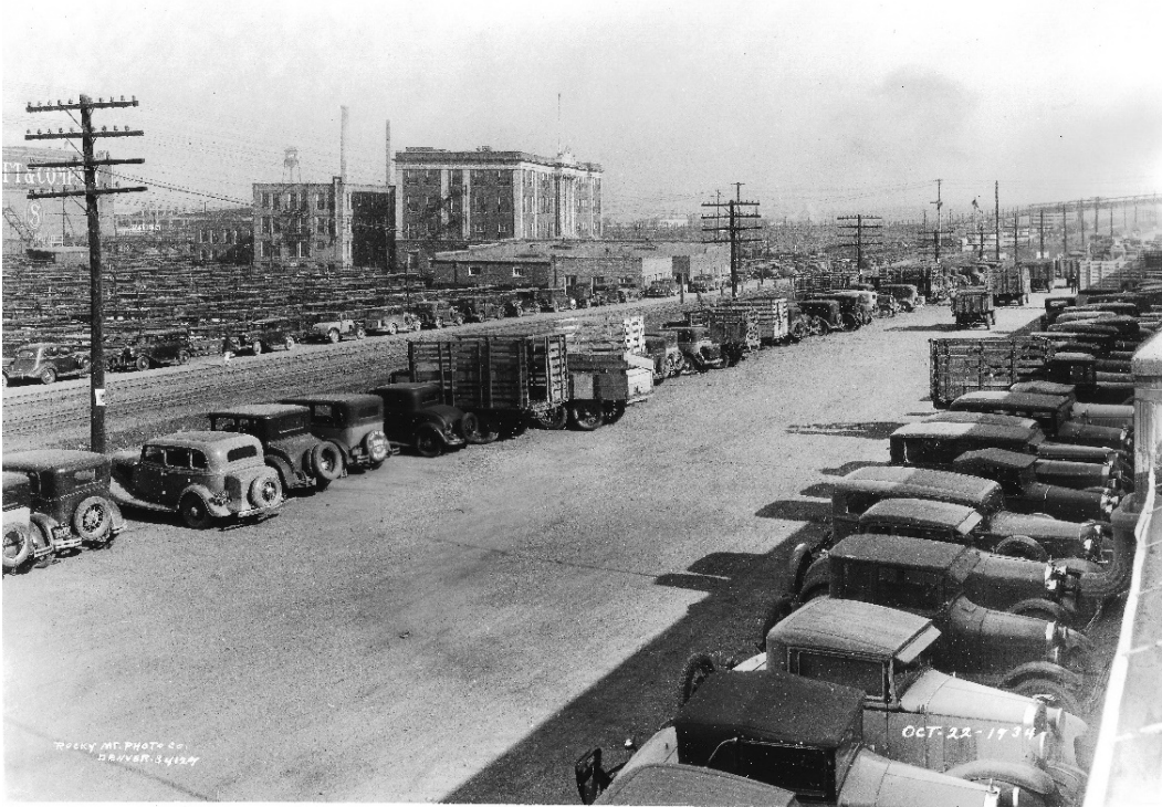
Figure B-4. 1934 photo of the complete Livestock Exchange and garage. Note the number of cars lining the streets around the yards. 83