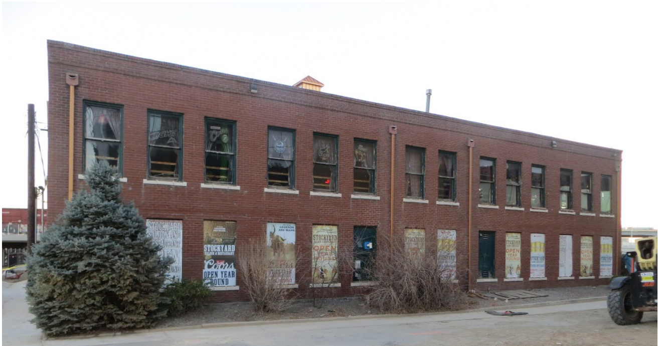
Figure B-15. 1919 structure, view facing southeast. 93