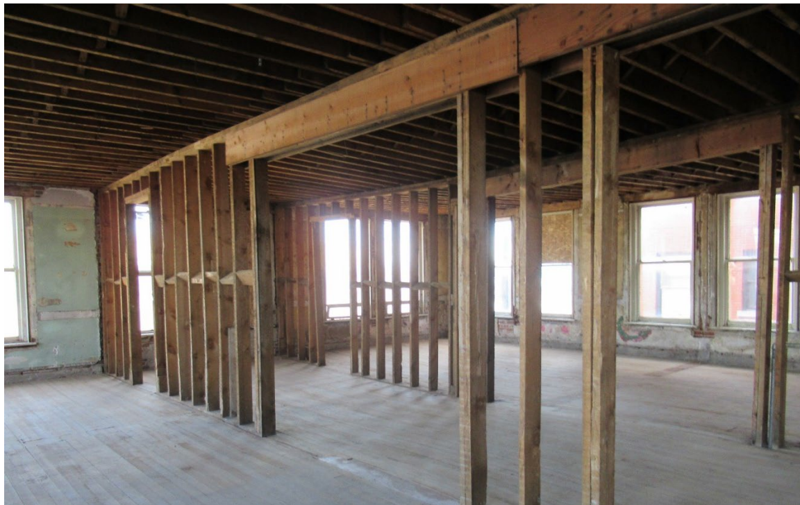
Figure B-18. Interior of 1898 structure. 101