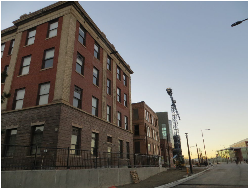
Figure B-18. 1916 (left), 1898 (center), 1919 (right) structures, View facing west. CSU SPUR buildings and crane also pictured. 96