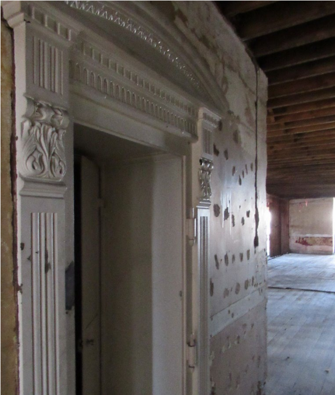
Figure B-20. Safe frame inside the 1898 structure. Frame matches the safe frame in the 1919 structure. 103