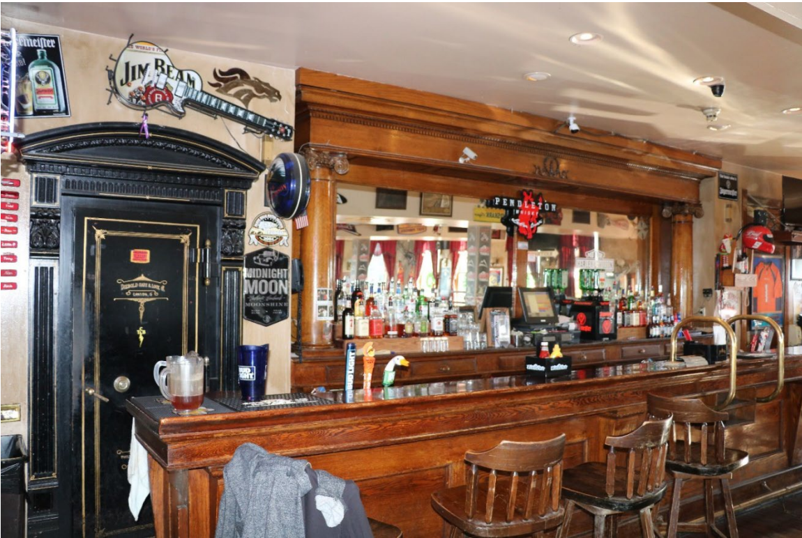
Figure B-22. Bar inside the Stockyard Saloon and Restaurant, possibly sourced from the former Windsor Hotel. Walk-in safe is original to the 1919 structure. 105