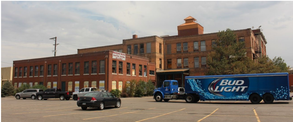
Figure B-10. Rear (northwest) elevation of the Livestock Exchange, showing all three structures. View facing east. 89