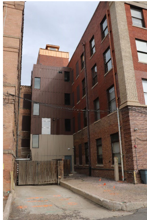
Figures B-11 and B-12. Connection between 1916 and 1898 structures, southwest (left) and northeast (right). Elevator tower with metal cupola and modern fire escape. 90