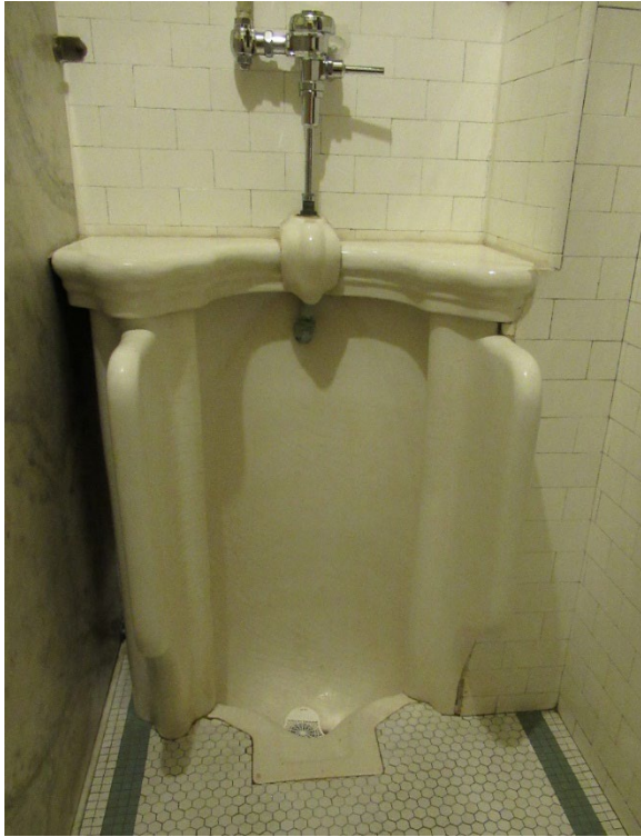
Figure B-16. Bathroom features including marble stall and urinal and hexagonal tile floor, 1916 structure. 99