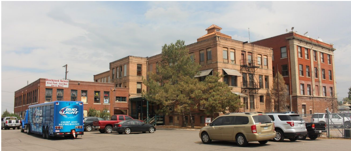
Figure B-9. Side (southwest) elevations of the Livestock Exchange. View facing northeast. 88