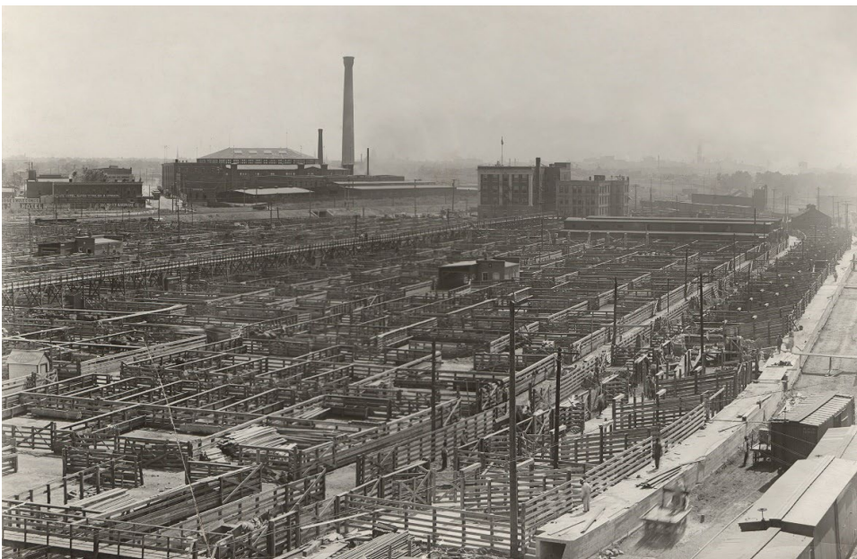
Figure B-3. Overview of the stock yards (facing south) and Livestock Exchange prior to construction of the 1919 structure. The 1909 Stadium Arena and smokestack of Omaha and Grant smelter can be seen in the background. 82