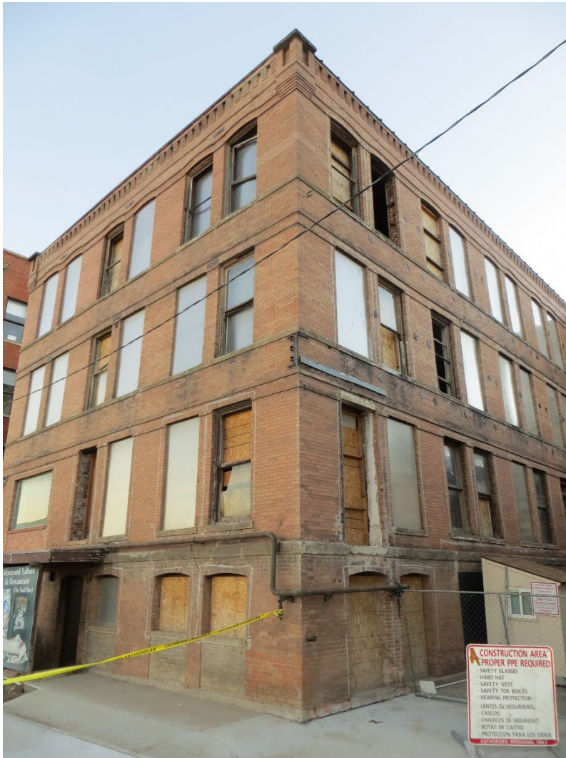
Figure B-16. 1898 Structure, view facing south. 94