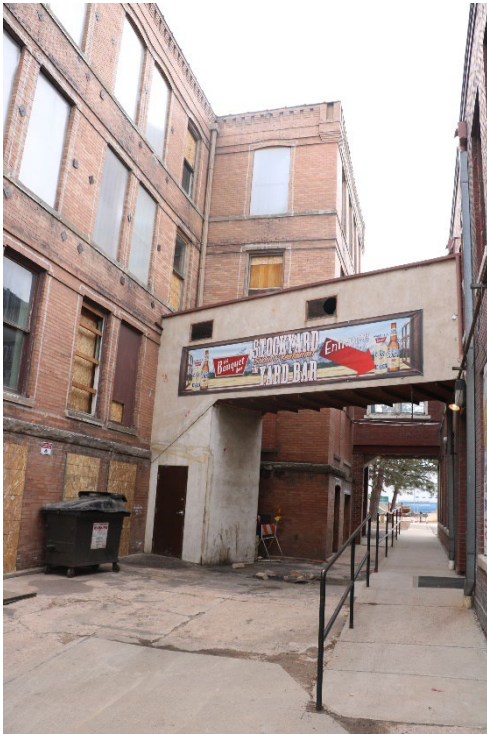
Figure B-13. Connection between 1898 and 1919 structures. Note the elevated concrete walkway, elevated brick walkway behind it, and concrete sidewalk with metal handrail. View facing southwest. 91