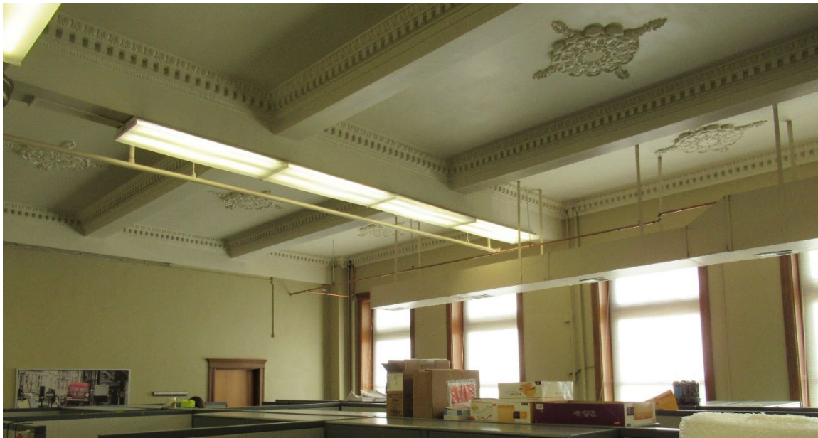
Figure B-15. Office with coffered ceiling and decorative motifs, 1916 structure. 98