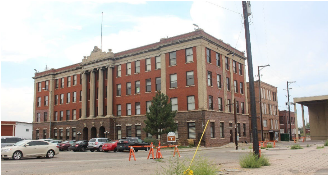
Figure B-8. Side (northeast) elevations of the Livestock Exchange showing all three structures. Left to right: 1916 structure, 1898 structure, 1919 structure View facing southwest. 87