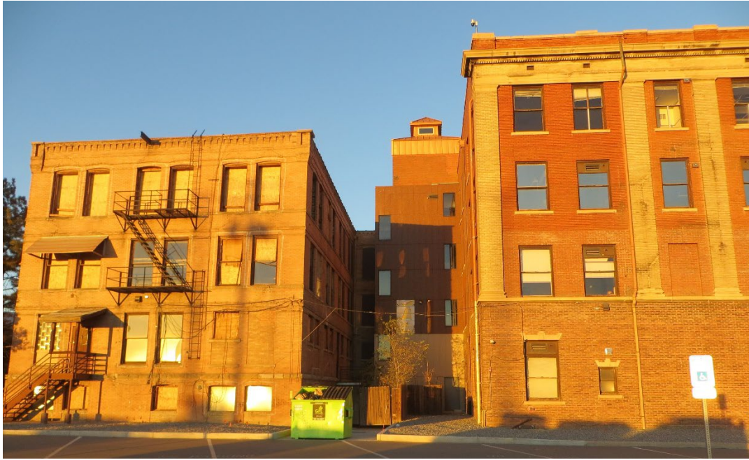
Figure B-17. 1898 (left) and 1916 (right) structures, view facing northeast. 95