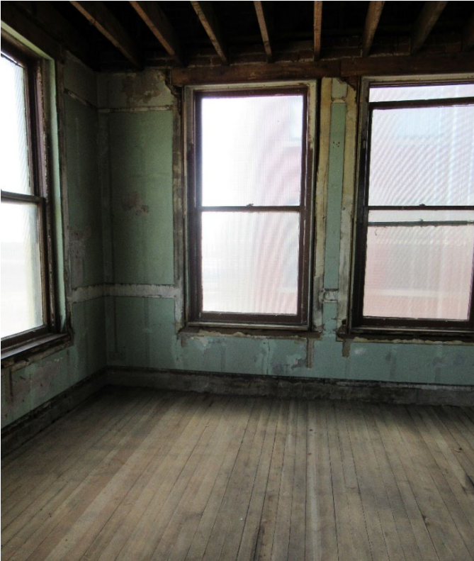
Figure B-19. Interior of 1898 structure. 102