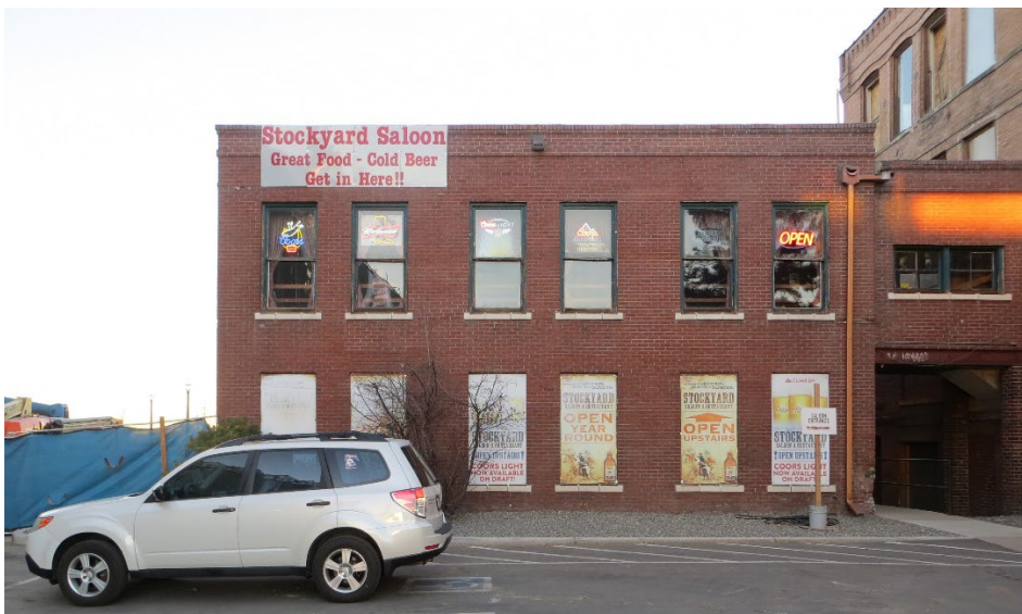
Figure B-14. 1919 structure, view facing northeast. 92