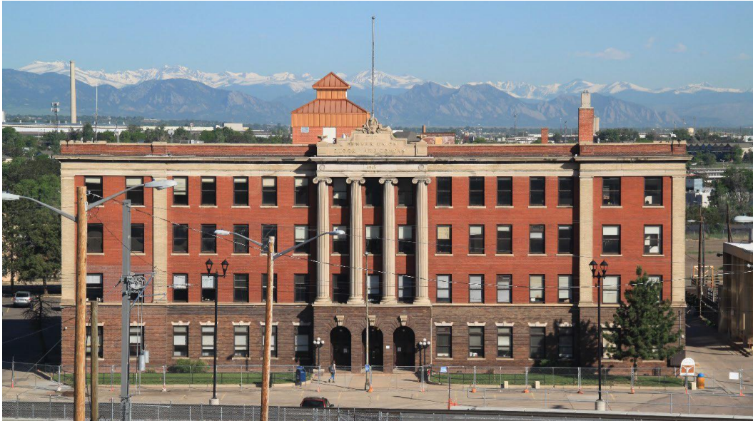
East elevation of the 1916 building - NWC Authority photograph, June 2019