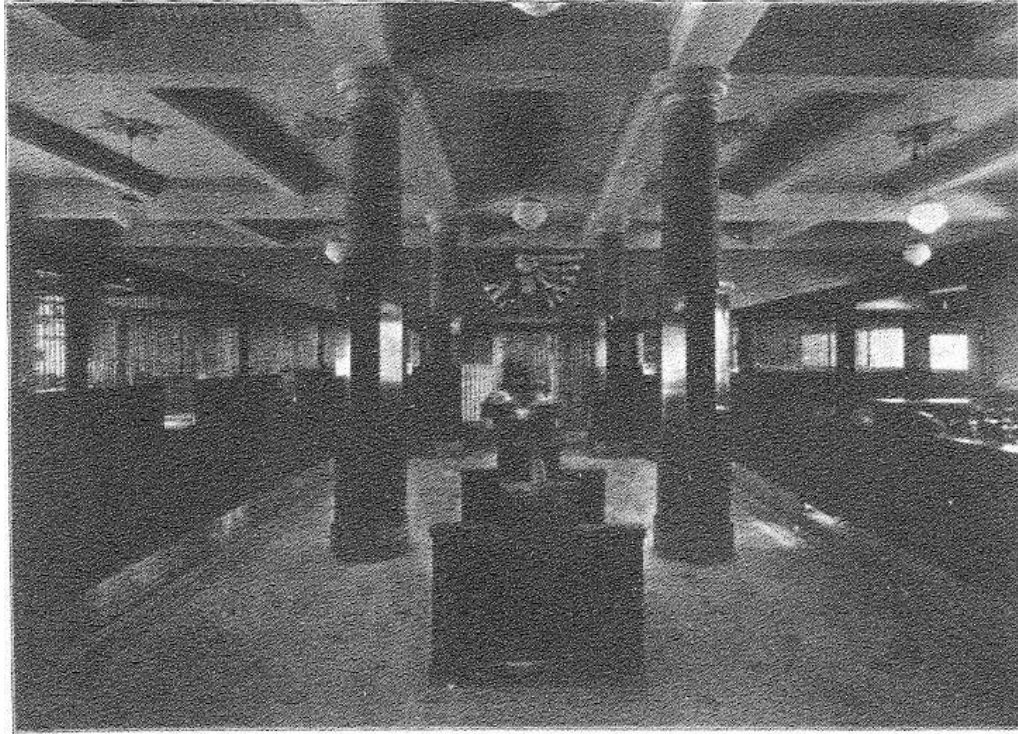
January 1918 advertisement in Record-Stockman Shows interior of building

monumental fluted ionic columns, embossed pediment, classical entablature, and the dominate center portico.