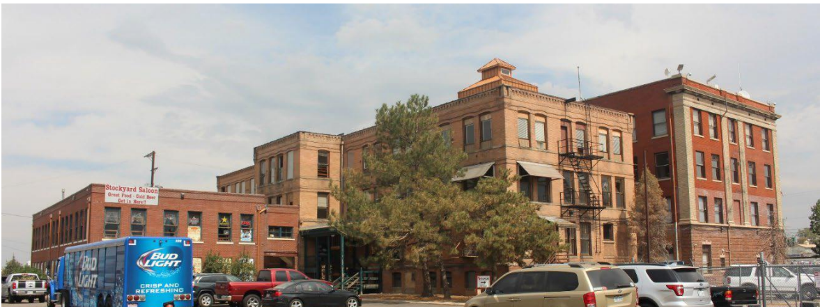
South elevations of all three buildings - Mead & Hunt photograph, August 2016