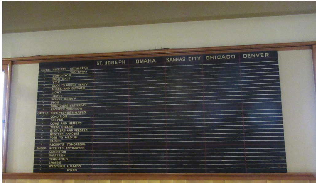
Chalkboard used for conducting business