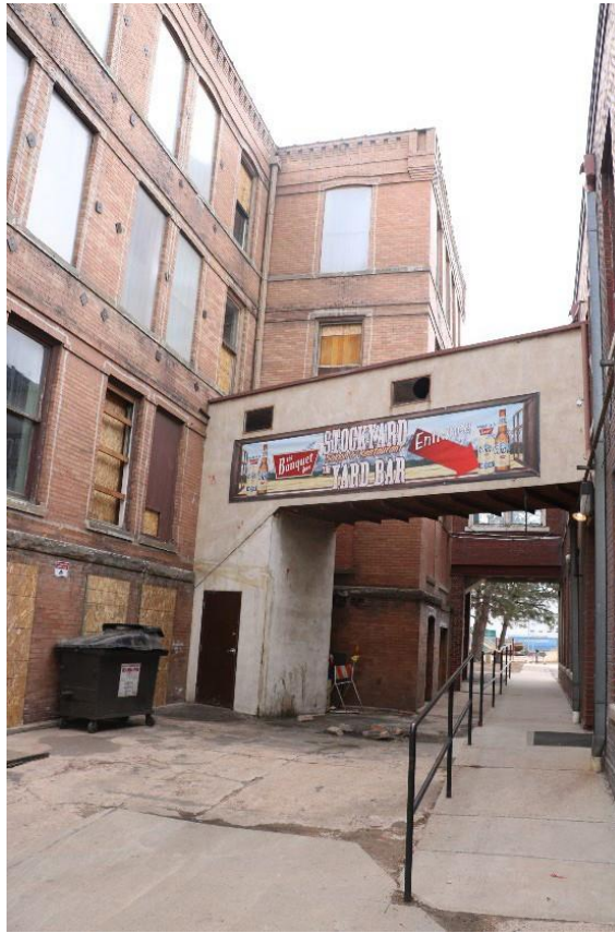
Walkway between 1898 and 1919 buildings, some boarded windows, and brick detailing Mead & Hunt photograph, November 2018