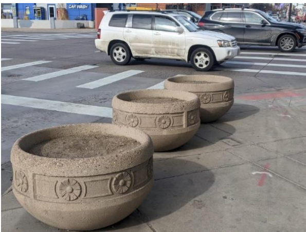
Three unmaintained planters