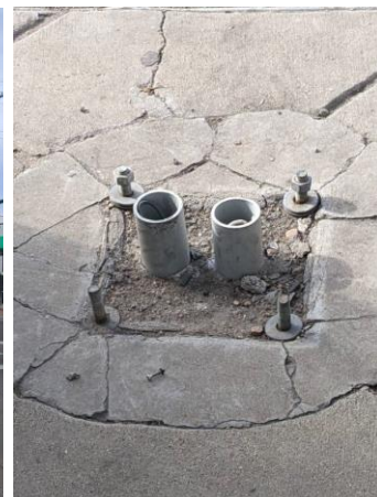
Remnants of a missing pedestrian light

To be completed by Mayor’s Legislative Team: