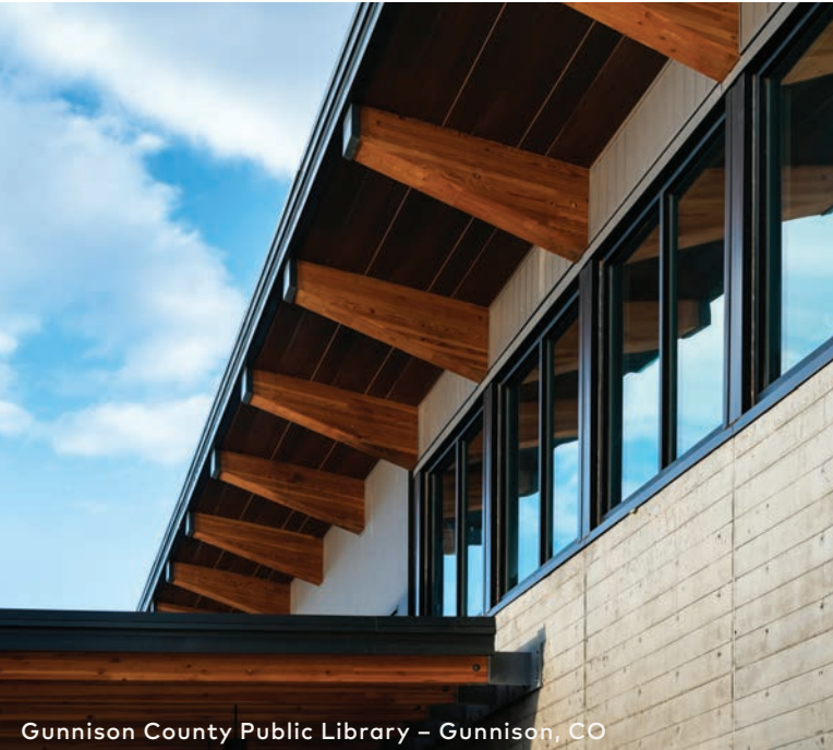
Gunnison County Public Library – Gunnison, CO