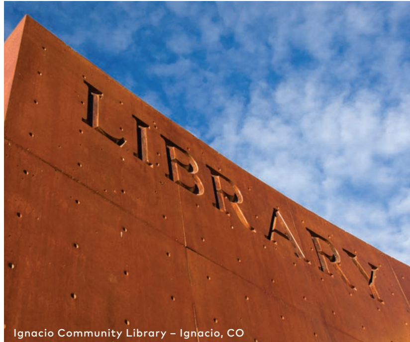
Ignacio Community Library – Ignacio, CO