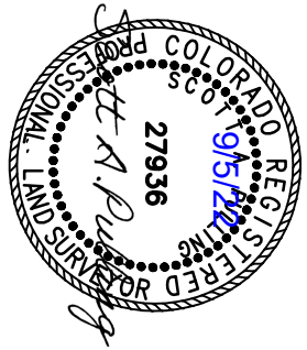
EXHIBIT A CITY AND COUNTY OF DENVER SW 1/4 SEC 24, T35, R68W

THIS EXHIBIT MAP DOES NOT REPRESENT A MONUMENTED LAND SURVEY, ITS SOLE PURPOSE TO TO ACCOMPANY ATTACHED LEGAL DESCRIPTION.