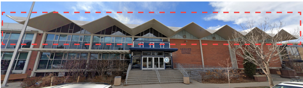
Figure 1-2 Existing folded plate roof

All new development in Subarea A shall conserve or match the existing folded plate roof of the Existing Building, which is dimensioned and shown in Figures 1-1 and 1-2.