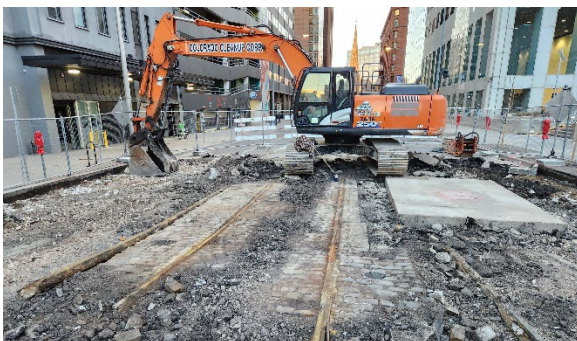
Historic trolley tracks discovered in Tremont intersection.