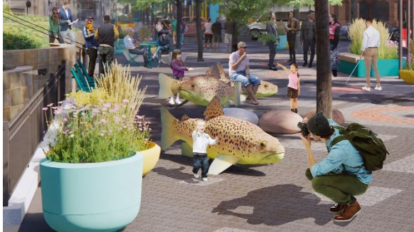
Greenback Cutthroat Trout Moment of Joy