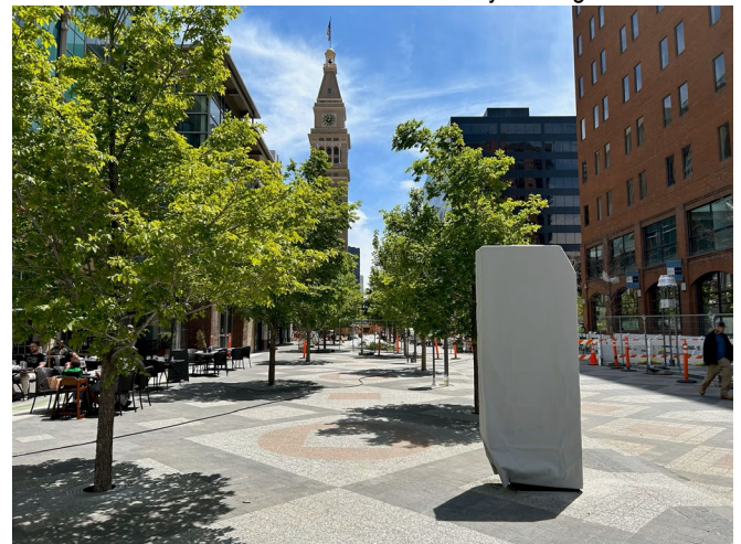
New granite and trees between Larimer and Lawrence.