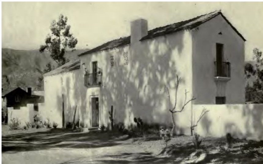
The 1916 “Casa Dracaena” in Montecito, California designed by architect G.W. Smith introduced a “vernacular,” everyday-house type of Spanish Eclectic Style house to California, and soon the entire United States through mass-market publications. The similarities between the structure and the 1924 Kunsmiller house are seen in the simplified linear massing, Juliet balconies and unadorned facades.

As architectural historian Abby Moor (2002:314) wrote of the Spanish Eclectic house style, “Both plan and façade have an attractive asymmetry...typically with a combination of varying roof levels and forms on one house.” The 1924 Kunsmiller House exhibits inspiration from the contemporary “Spanish Eclectic” house designs of contemporaneous architect G.W. Smith: simple massing and modest entry into a linear plan with varying roof levels and an asymmetrical layout. According to Moor, G.W. Smith...formulated a Spanish Eclectic architectural style grounded in a picturesque Andalusian idyll of massed white geometric planes and surfaces, austere facades, a very few shuttered windows along otherwise windowless walls, red-tiled roofs and understated parapets, and a cool and secluded courtyard garden.