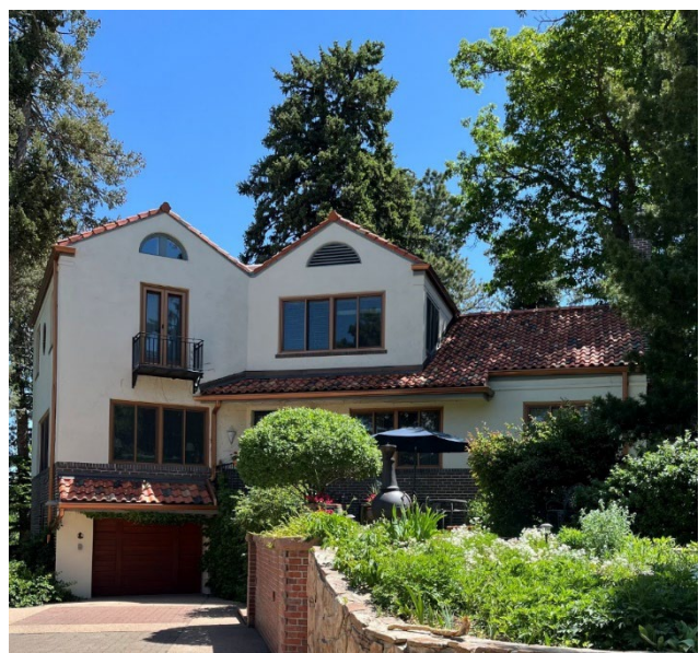
M RS. DOROTHEA KUNSMILLER, member of the Denver school board, lives in the fine residence shown above. It is located at 5086 Vrain street, and its assessed valuation is $7,120. Below is shown the home