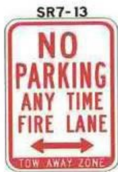
FIGURE 503.3 FIRE LANE SIGNS

Sections 503.4.1 Traffic calming devices is replaced as follows: