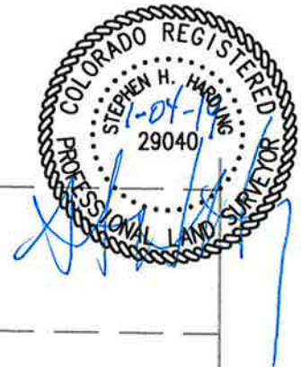
EXHIBIT A SHEET 2 OF 2

GRAPHIC SCALE 0 15 30 45 1 INCH = 30 FEET