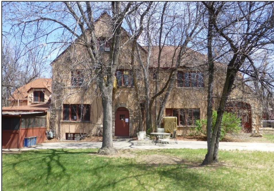
2900 South University Blvd, photo 2018

Planning Services Community Planning and Development 201 W. Colfax Ave., Dept. 205 | Denver, CO 80202 www.denvergov.org/CPD p. 720.865.2983