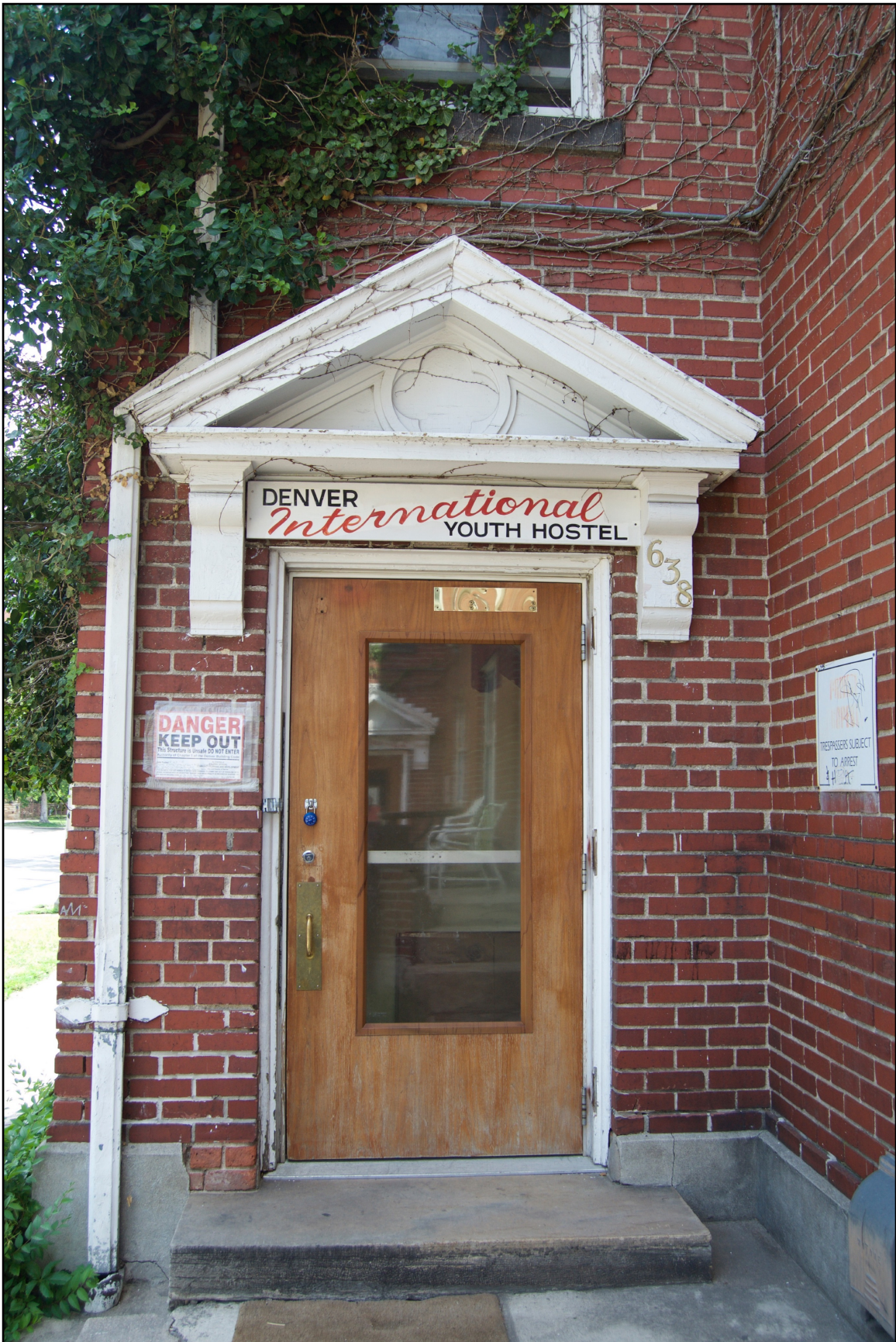
Main entrance into east wing