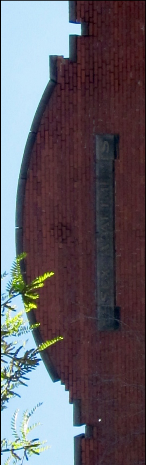
Parapet and entablature that reads "ESSEX APARTMENTS"