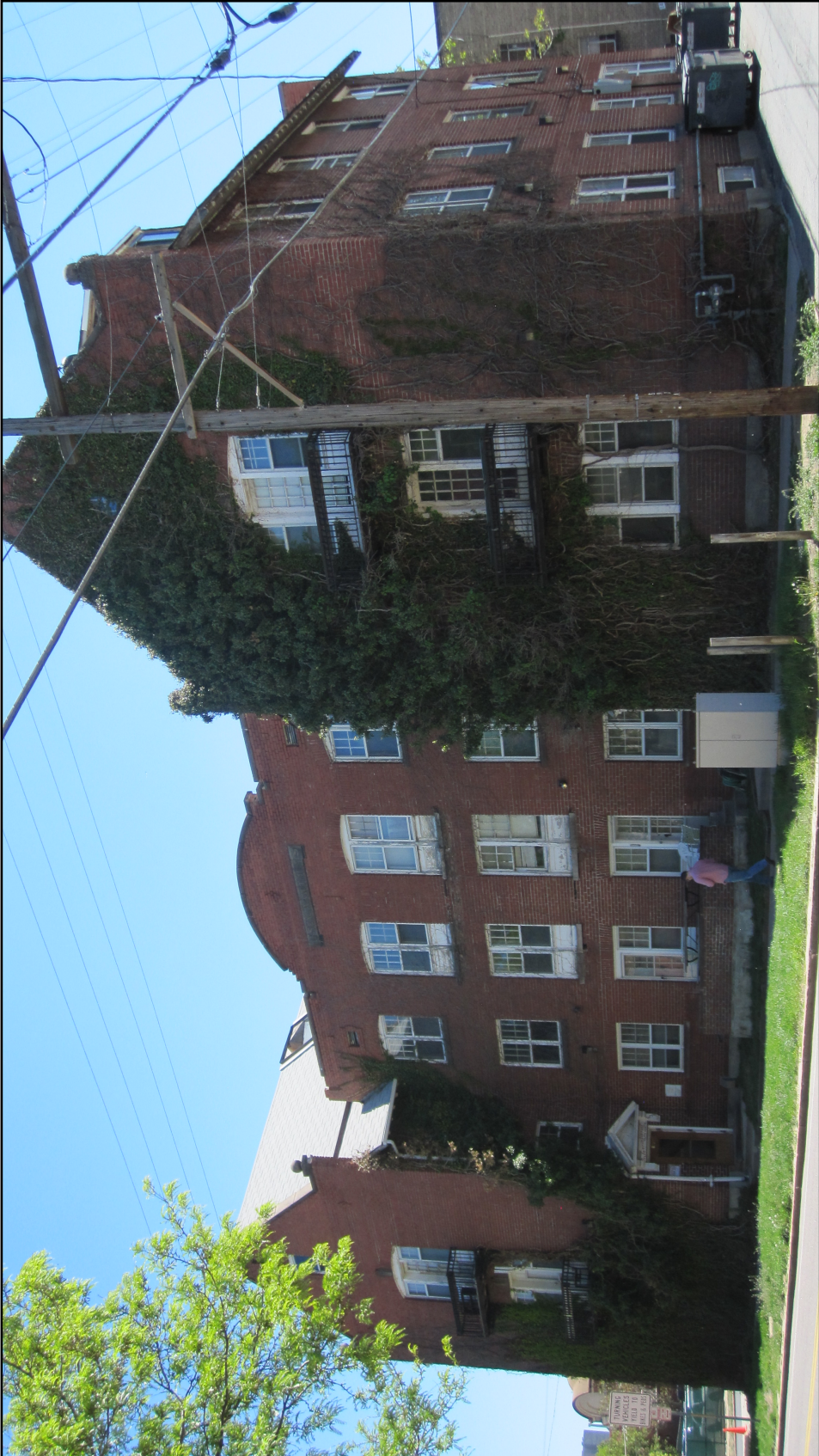
Looking southeast at north facade and west elevation