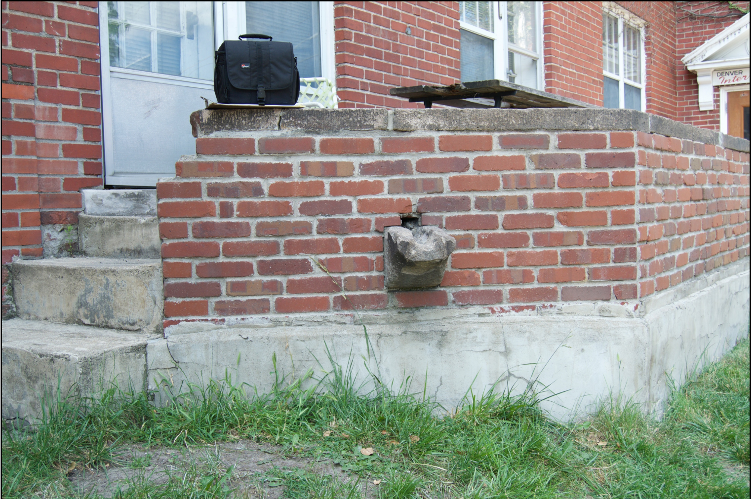
Remains of original porch on north facade