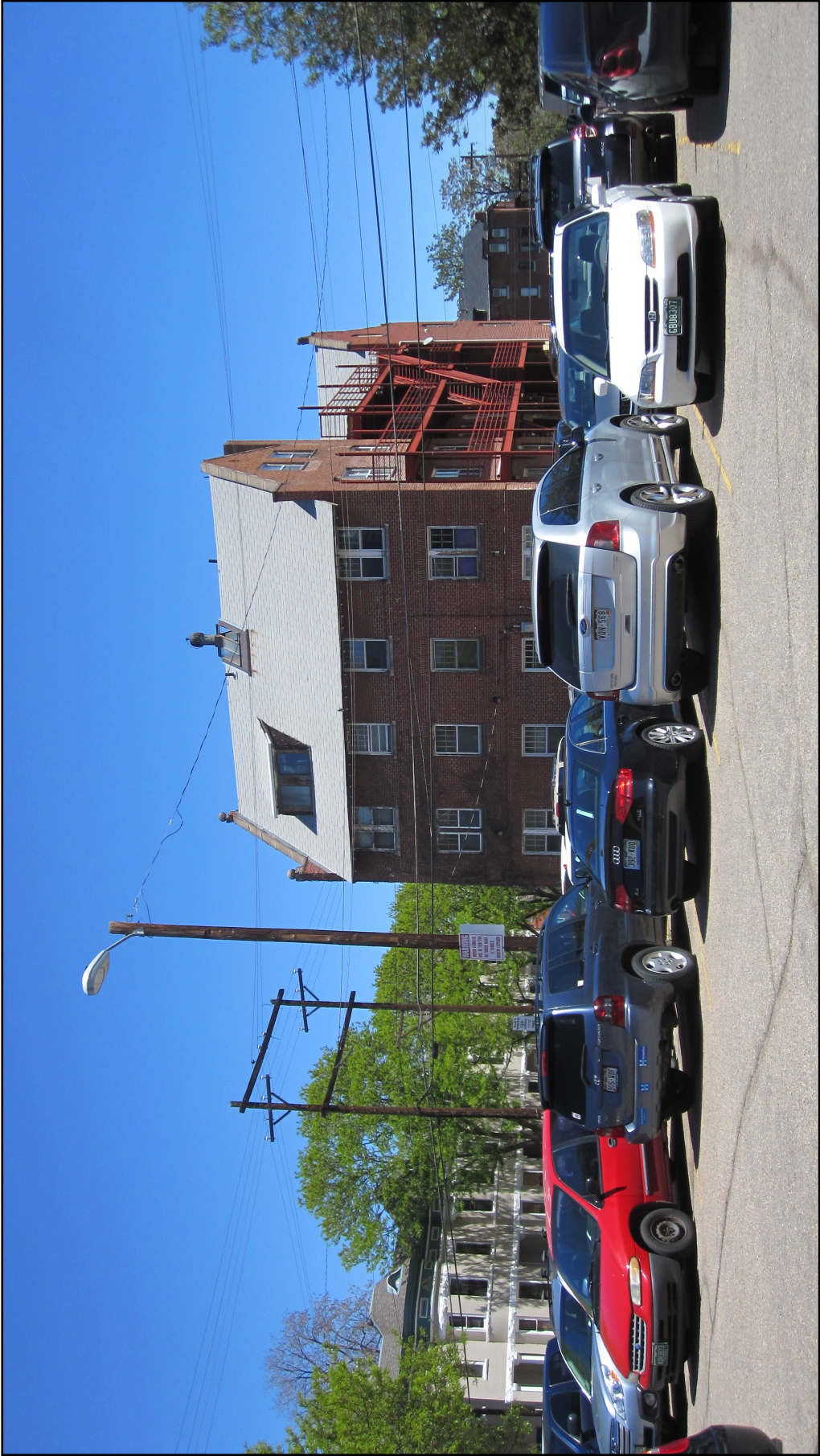
Looking east at west elevation and partial view of rear (south)