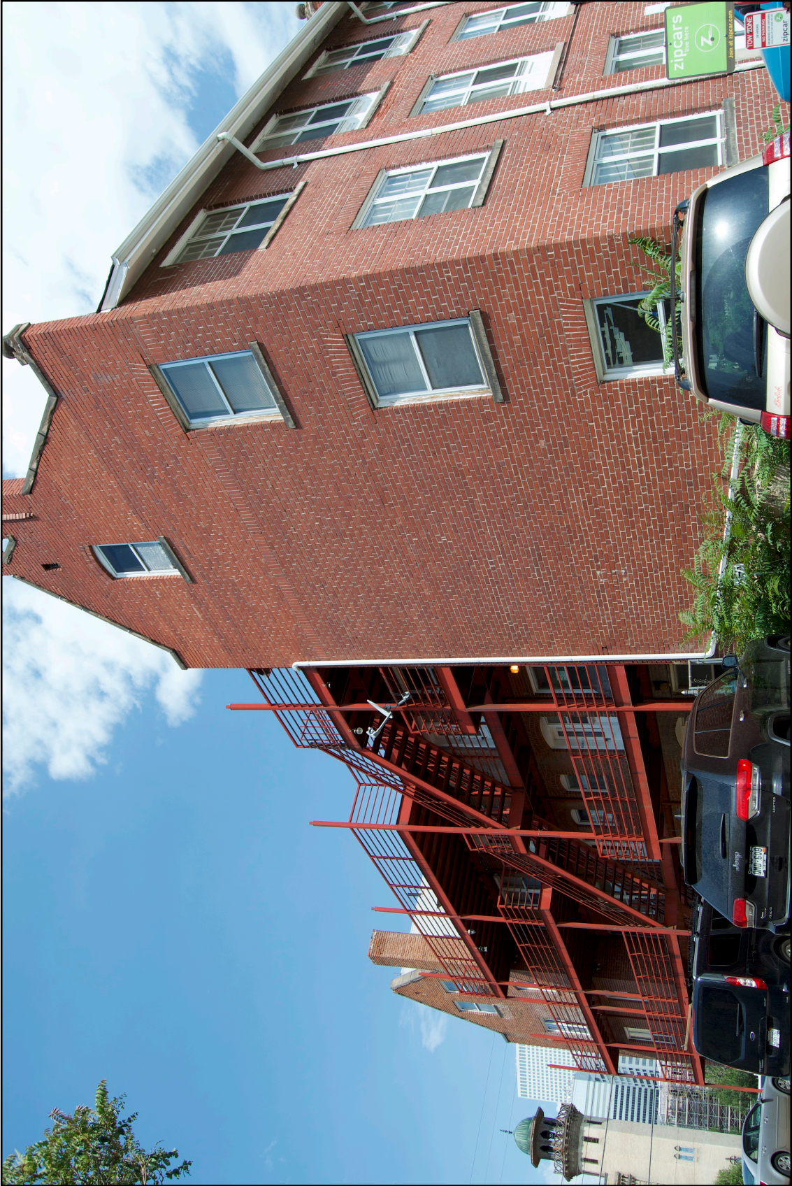
Looking northwest at south elevation