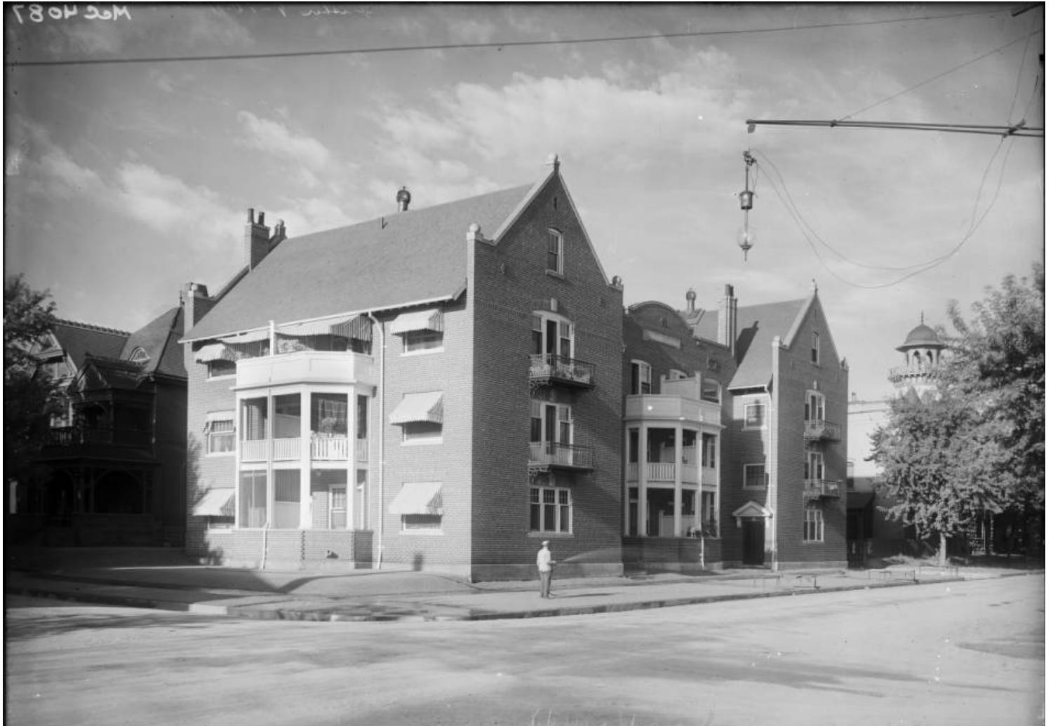
1912 photograph