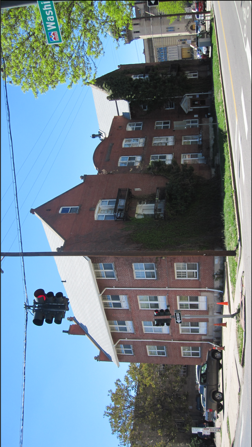
Looking southwest at north facade and east elevation