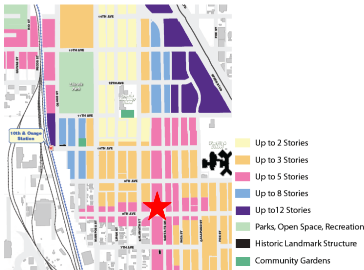
Lincoln/La Alma Park Neighborhood Plan Building Heights Map