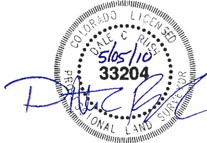
EXHIBIT ATTACHED AND MADE A PART HEREOF.