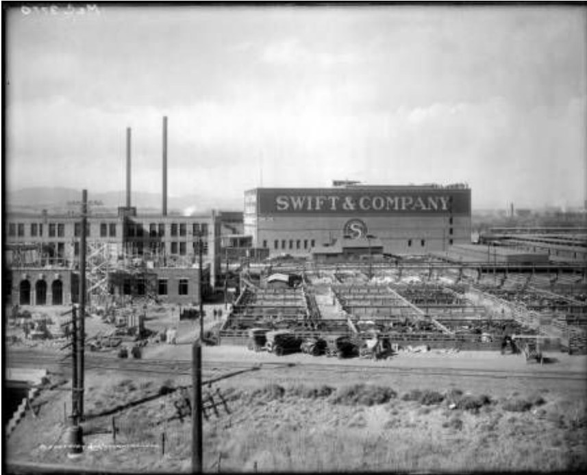
Figure B-2. Photo of the Livestock Exchange during construction of the 1916 structure. Swift and Co. packing plant seen in the background. 81