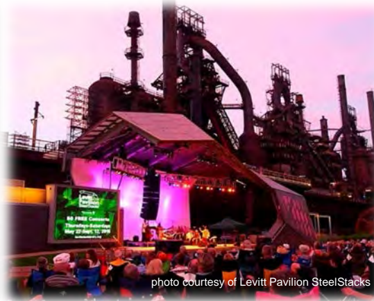
Levitt Pavilion, Bethlehem