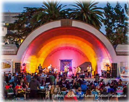
Levitt Pavilion, Pasadena