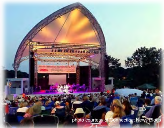
Levitt Pavilion, Westport