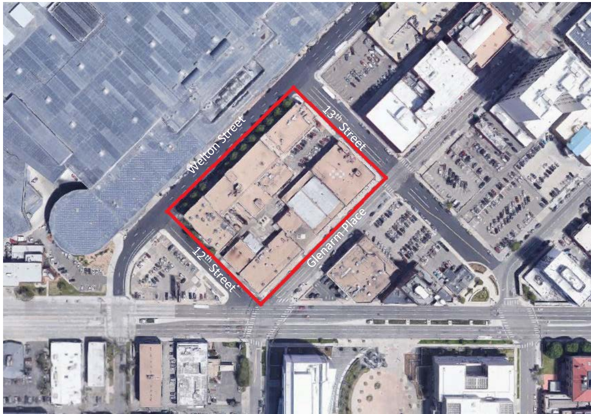
Emily Griffith Opportunity School Project and URA Boundary

Denver Urban Renewal Authority (DURA) for more information and illustrative renderings of the proposed project.