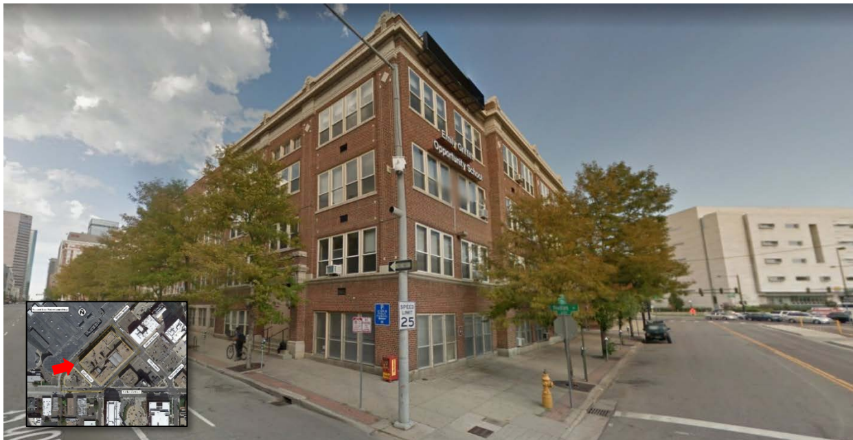
Project site, View from Welton Street and 12th Street looking northeast