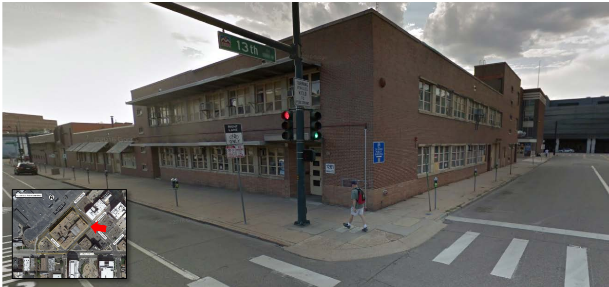
Project Site, View from Glenarm Place and 13 th Street looking northwest